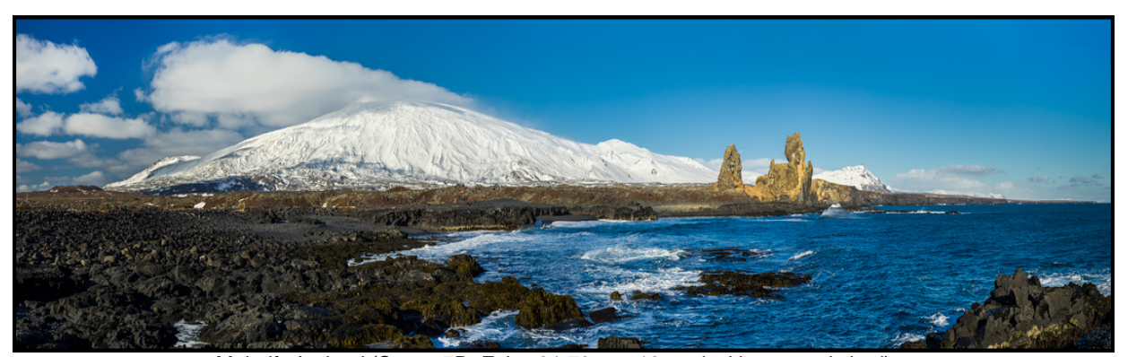
Malarif - Iceland (Sony a7R, Zeiss 24-70mm, 12 vertical images stitched)

<u>Legal Notice</u>: Written and Photographic Content © E.J. Peiker, Nature Photographer. The text and photographs contained herein may not be copied or reproduced without written consent. This newsletter may be forwarded without restriction unaltered and in its entirety only.