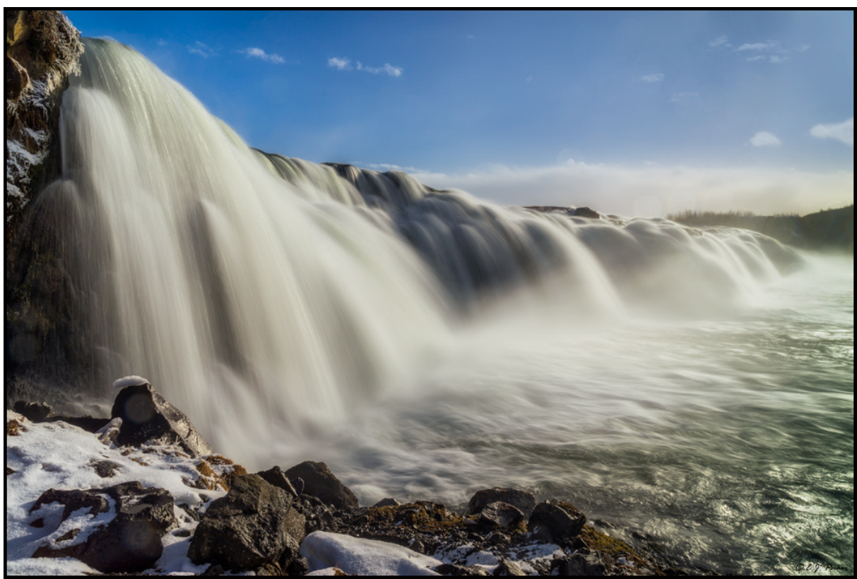
Faxi Foss - Iceland (Sony a7R, Zeiss 24-70mm f/4)

- During the second half of the trip, I had the new firmware version (1.0.2) installed. This dramatically improved my enjoyment of shooting with this camera. The camera start-up delay,