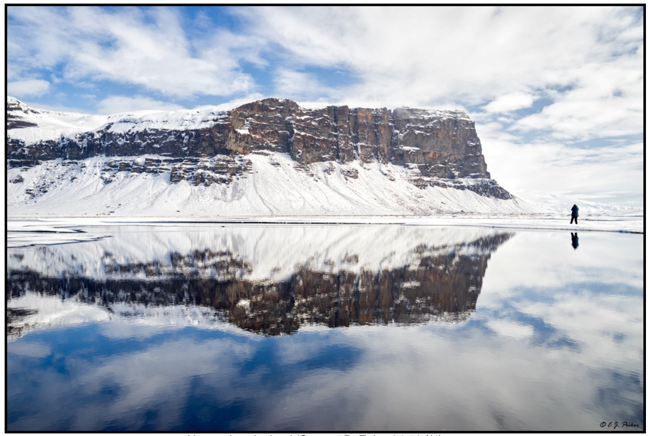
Nupstadur - Iceland (Sony a7R, Zeiss 24-70 f/4)