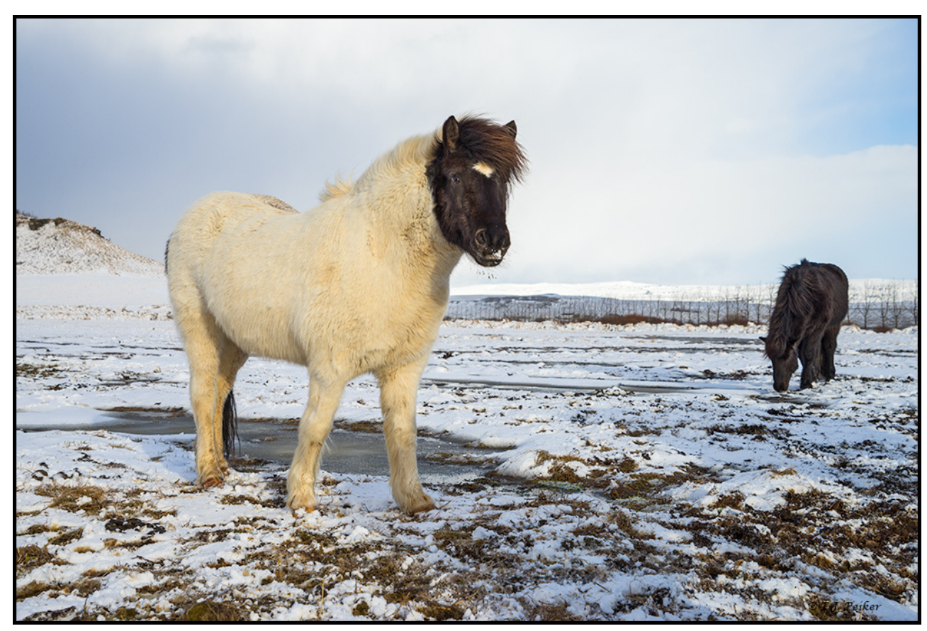
Icelandic Horse - Iceland, (Sony a7R, Zeiss 24-70mm f/4)