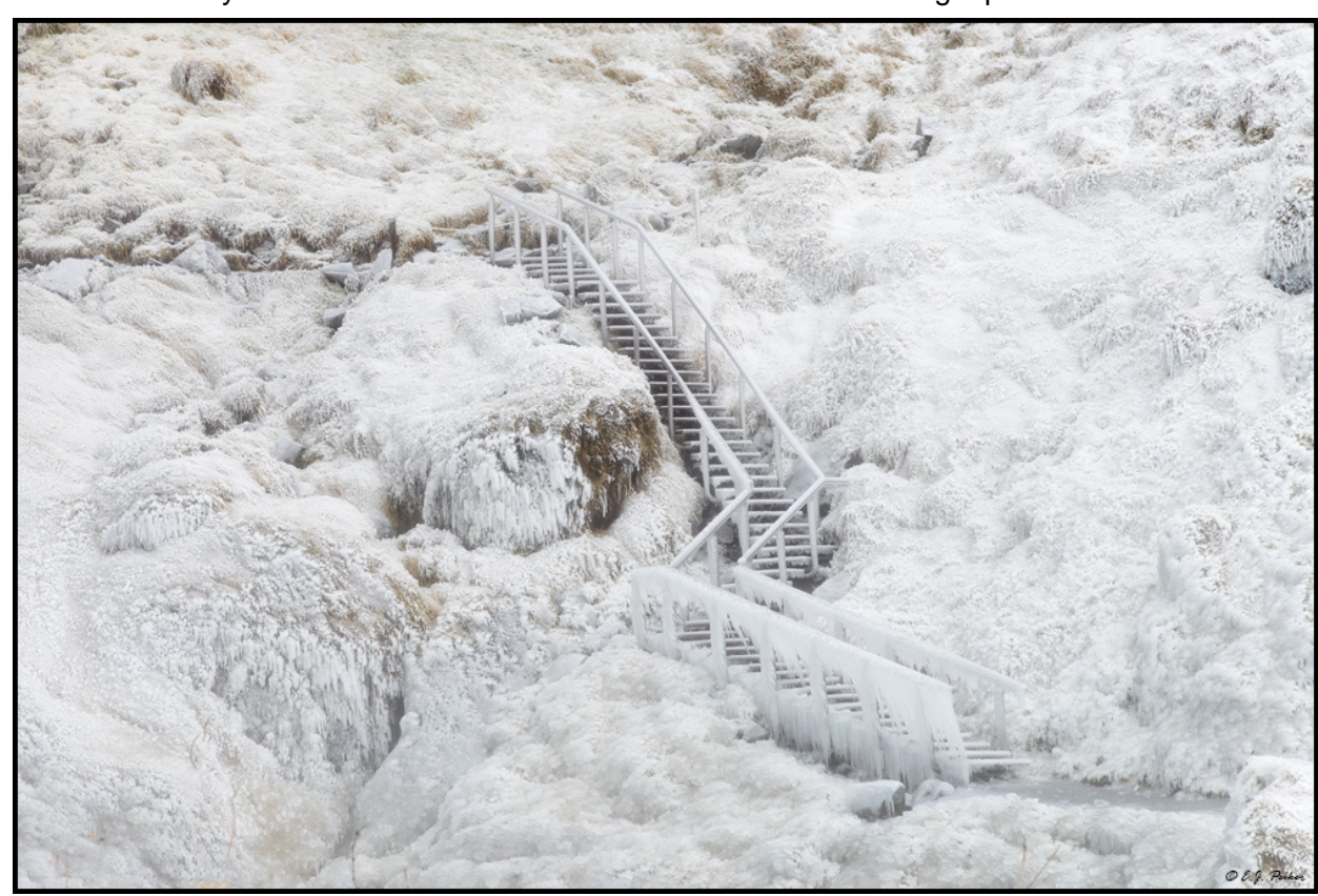
SeljanInadsfoss - Iceland (Sony a7R, Nikkor 70-200 f/4, Novoflex adapter)