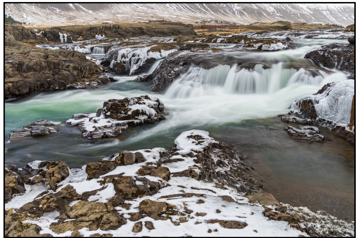
Laxa i Kjos - Iceland (Sony a7R, 24-70mm)

For the complete review that analyzes all of the different lens performance parameters of the Zeiss 24-70mm f/4 lens can be found at <a href="http://www.ejphoto.com/Quack%20PDF/Sony-Zeiss%2024-70mm%20Review.pdf">http://www.ejphoto.com/Quack%20PDF/Sony-Zeiss%2024-70mm%20Review.pdf</a>