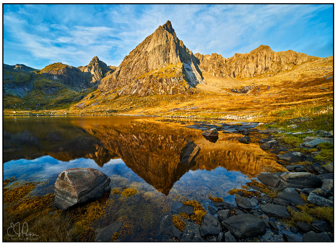
Lofoten, Norway - Voigtländer 12mm

Overall I am elated that Voigtländer has come to the E-mount party with such unique and exceptional lenses in such a small package. I could not be happier with the lenses and highly recommend them to Sony a7 series landscape shooters.