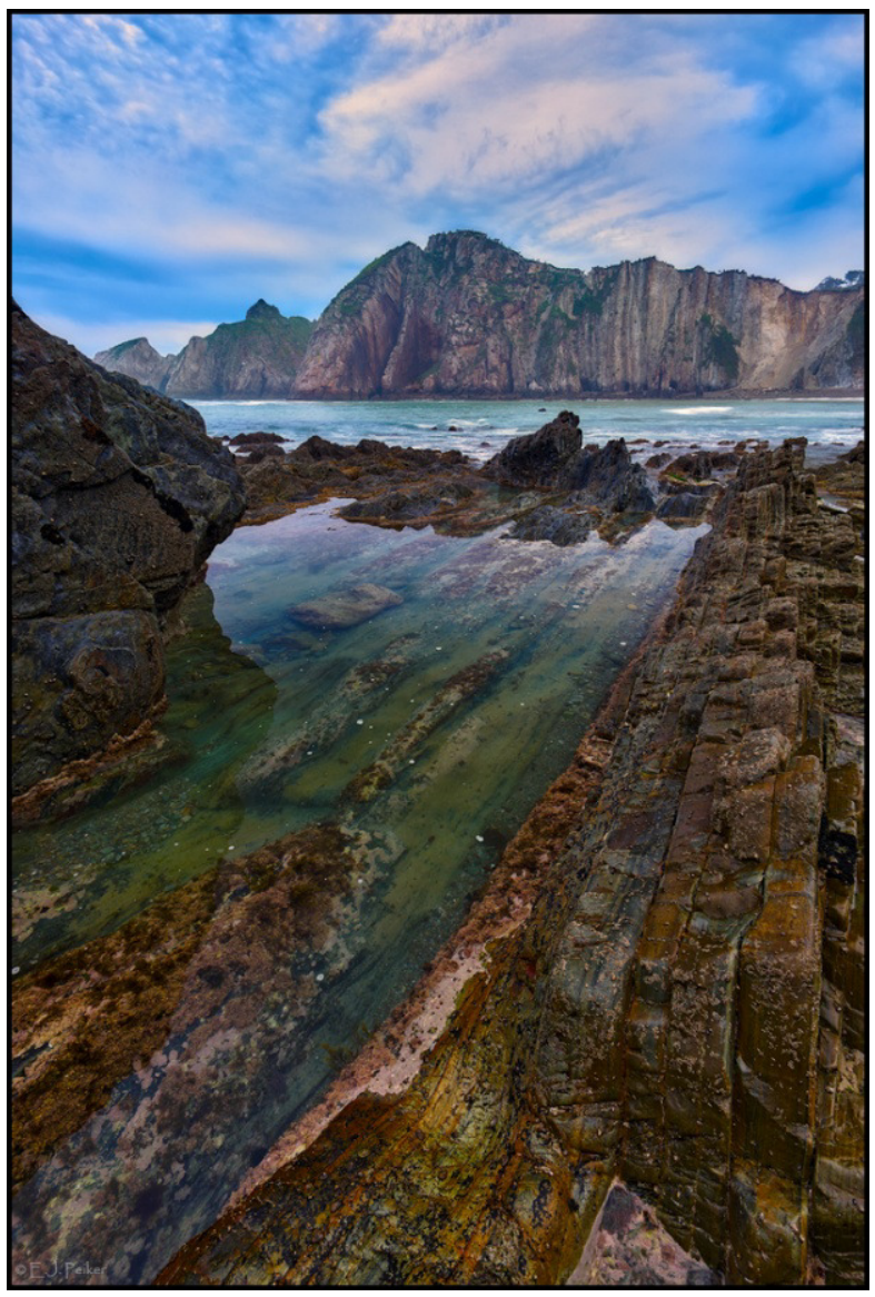
Asturias, Spain - Voigtländer 15mm

Voigtländer met their Q1/2016 release target only for the 15mm and I was fortunate to receive one of the very first production lenses in the USA and immediately put it to the test. I was blown away by how much better the lens is, image quality wise, than the 16mm end of the Sony-Zeiss 16-35 f/4 lens in a lens that is a fraction of the size and has drastically more robust build quality and it allows you to actually set a hyperfocal point. Simply setting the lens to f/8 and the focus ring to 7 feet renders everything from 3.5 feet to infinity sharp even with a highly conservative circle of confusion of 12 microns on the a7R Mk II's 42 megapixel sensor. A landscaper could essentially tape the lens down at that setting and never have to make another change. Linear distortion is very well controlled and while there is vignetting, it is no worse than any other super wide lens and better than many. The angle of view is 110 degrees, it uses a 10 blade aperture ring and weighs just 298g or 10.5oz despite the all metal construction. The Voigtländer 15mm was so good that I had no hesitation in purchasing the lens and then