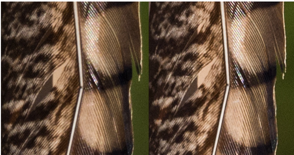
Sigma 150-600mm @400mm (left) vs. Nikon 80-400mm @ 400mm, 40 feet, f/8

Comparing the lens to the Nikon 80-400mm f/4.5-5.6G VR (the new 80-400), the Sigma equals or beats the Nikon for resolution at every focal length and aperture in the range where they overlap on the test chart. And when you add the much higher build quality, higher level of customization, much longer focal length on the long end at a lower price, the only thing that justifies keeping the 80-400G is its smaller size and lower weight. In a feather detail comparison taken with the Sigma 150-600 at 400mm and the Nikon 80-400mm there is very little difference. The Nikon lens has a tiny bit more contrast but on the D7200 sensor also shows a bit more moiré pattern interference, It also has slightly less magnification. The samples were shot at a distance of 40 feet and 100% crops are illustrated below.