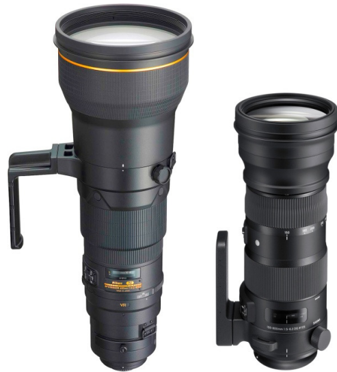
Nikon 600mm f/4G vs. Sigma 150-600mm Sport Size comparison

Excellent image quality in a super tele zoom like this does come with the penalty of weight though. The lens, with the integrated enhanced foot is approximately the same weight as the Canon 500mm f4L II or the newly announced, but not yet available at the time of this review, Nikon 500mm f/4E VR even though they give you 1 1/3 stops more light gathering capability at 500mm. Physically, the Sigma lens is substantially smaller though making it easier to pack while reaching all the way out to 600mm without the large drop in image quality at the longest focal lengths that is so common with super-tele zooms. In a world of increasing airline regulations on what can be brought on-board as carry-on luggage, the smaller size in a lens capable of reaching 600mm is important. Comparing it to something at least in the same general price range, the 80/100-400mm class lenses, it outperforms them for image quality while having significantly more reach but at a 1/3 stop penalty in light gathering and a substantial weight penalty.