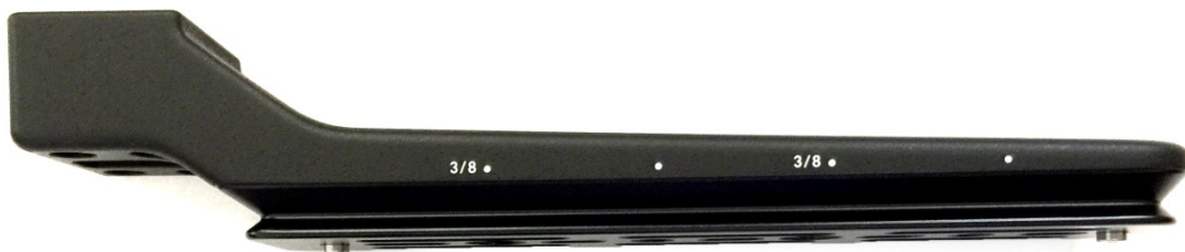
Sigma Replacement Foot

foot that covered the whole stock foot, the camera, even with optional battery grip, could not be balanced on either a Wimberley Head or the 4th Generation Design Mongoose head. When zoomed to the longer focal lengths it is grossly out of balance. This realization prompted a search for a longer replacement foot with built in Arca Swiss quick release dovetail. I was disappointed that neither Really Right Stuff nor Kirk made a replacement foot yet but my search revealed that Sigma actually makes a dovetailed replacement foot for the lens. It is however not yet shipping in the USA. I was able to find an online Japanese distributor that sent me one. It is dramatically longer than the stock foot (and much heavier) but works really well and allows the lens to be balanced. The only downside to the Sigma replacement foot is that it increases the weight of the lens to 7lb. I did notice that the Sigma foot has a slightly narrower track than the replacement feet from RRS, Kirk, 4th Generation, or NatureScapes requiring me adjust the clamp on the Mongoose I was using for this review. Screw type quick release mechanisms won't have a problem but clamps need to be adjusted and once adjusted properly for this foot, may not be able to accommodate other feet.