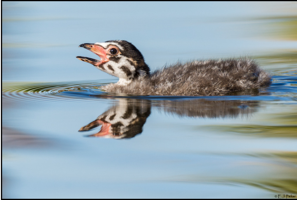
Pied-billed Grebe Chick - D7200, Sigma 150-600 @ 600mm f/8