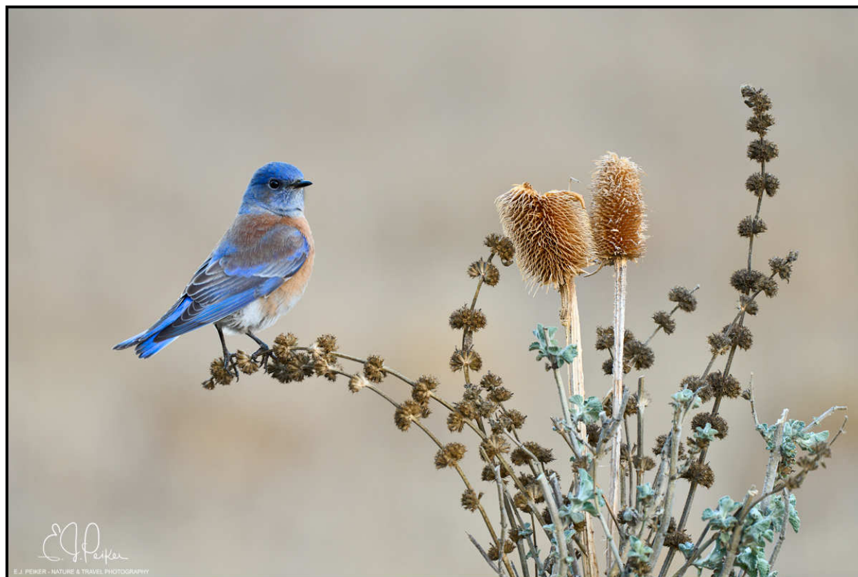
Western Bluebird – California (a1, 200-600mm)