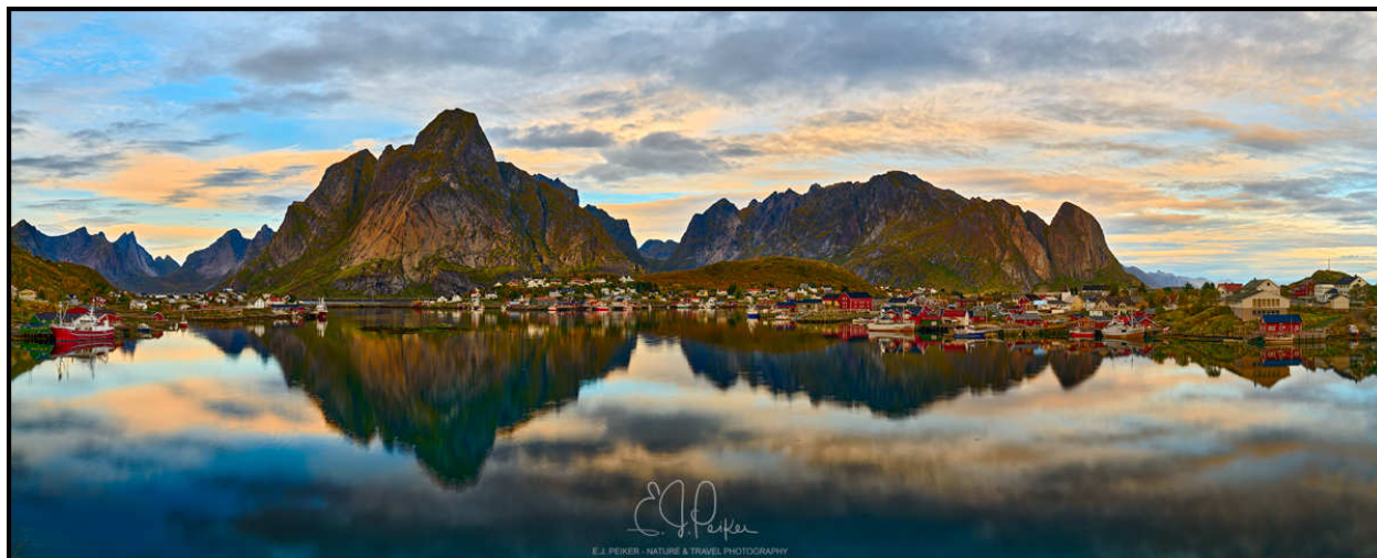
Arctic Norway (a7R3, 50mm x 7 exposures)

Legal Notice: Written and Photographic Content © 2022 - E.J. Peiker, Nature & Travel Photography. The text and photographs contained herein may not be copied or reproduced without written consent. This newsletter may be forwarded without restriction unaltered and in its entirety only.