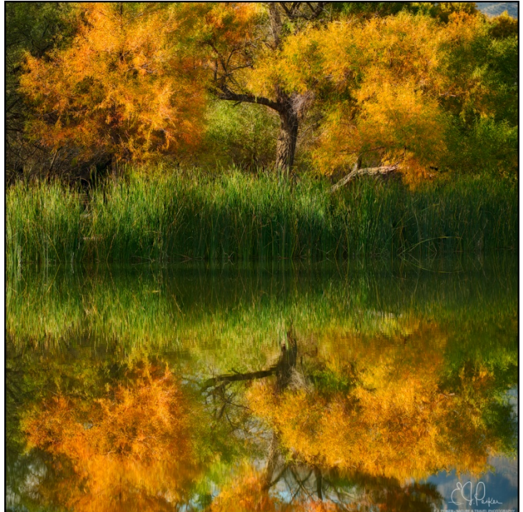
Cottonwood - Arizona (GFX-100S, 100-200mm)

There was much promise for a great fall color season in Arizona since we had one of the wettest monsoon years in a long time. In general, the more rain Arizona gets in the summer, the better the fall color. The stage had been set but then a massive two day windstorm with sustained winds of 35MPH and gusts to over 50 in much of the state right as the Aspens were starting to peak stripped it all bare. Fortunately, the cottonwoods, oaks and maples which peak one to two months later were not heavily affected as they were still green. Despite the challenges, I was able to photograph some Aspen on the morning before the storm hit in eastern Arizona's White Mountains. A few weeks later, I got some very nice shots of Cottonwoods in the middle elevations. While in California for the Birds of California shoot, I was also able to get some fall color shots along the Santa Ynez River.