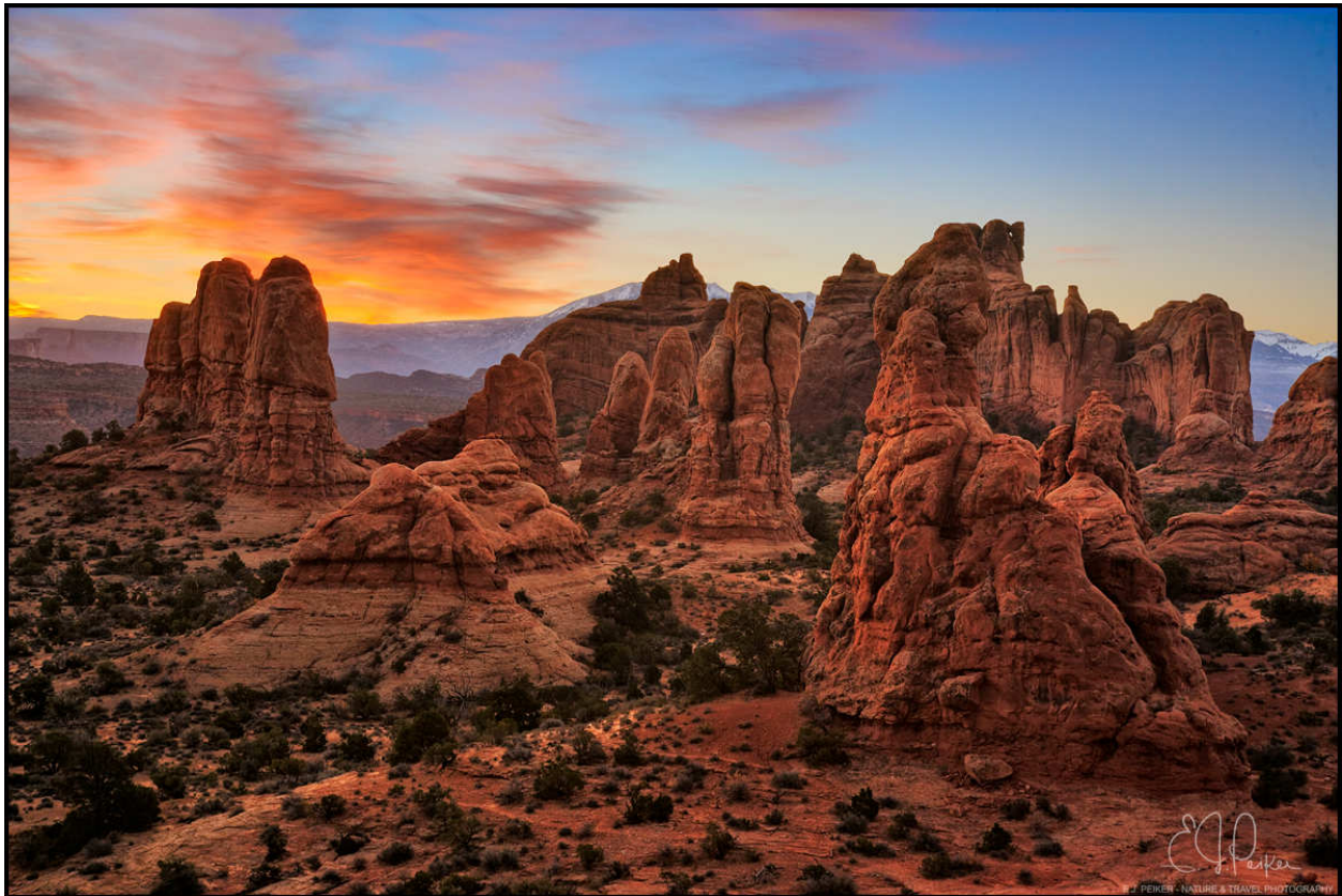
Eastern Utah (EOS 1Ds Mk II, 24-70mm)

In next quarter's newsletter I will cover the gear I am using for various types of photography in 2023 – not only will the a7R5 be in full use, I will also finally have a chance to use the incredible Tamron 35-150mm f/2-2.8 extensively resulting in an ultra-compact landscape kit when coupled with the Sony 16-35mm f/2.8 in a two lens, one camera set-up that covers almost everything a landscape photographer needs most of the time with top notch optics. The Tamron 35-150mm lens has been on backorder for 2 years but I finally got one.