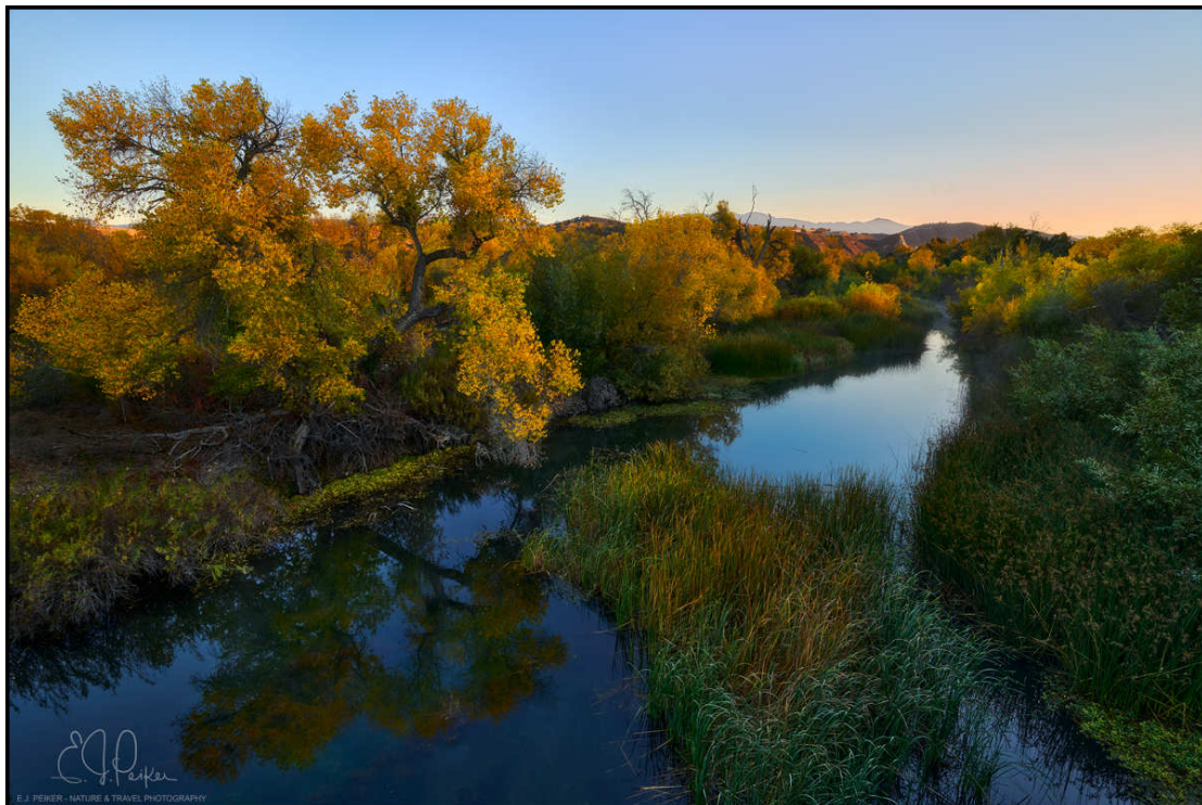
Santa Ynez River - California (a7R4, 17-28mm)