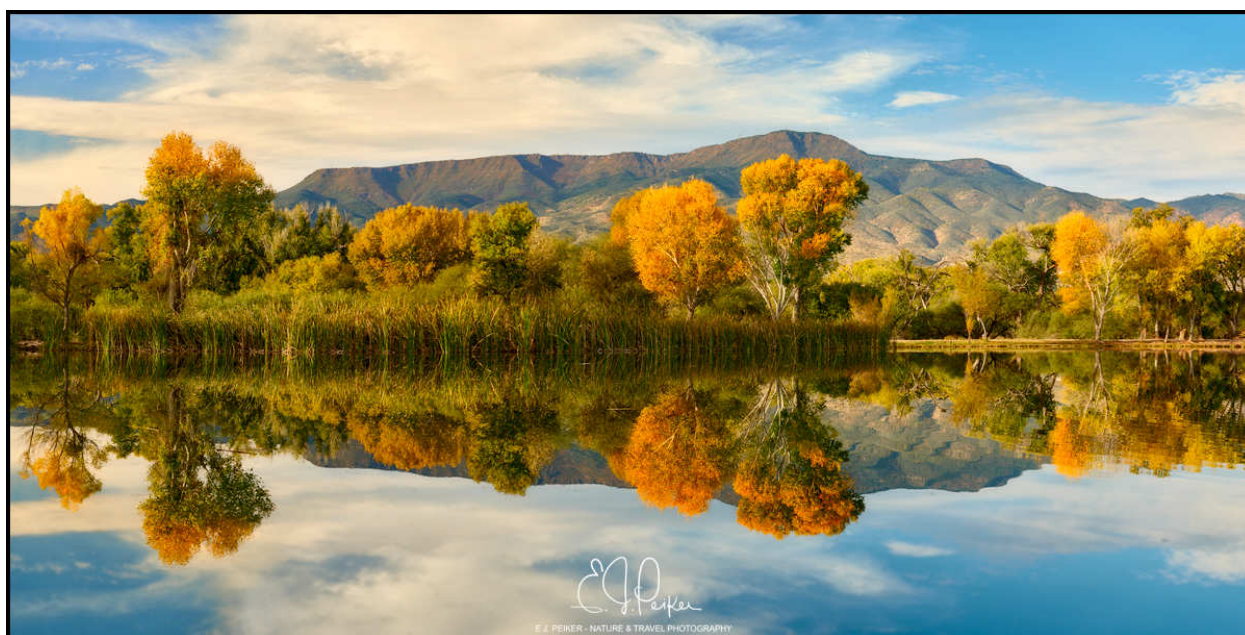
Cottonwood – Arizona (GFX-100S, 20-35mm)

This newsletter begins the 22 nd year of publishing them, and I continue to be honored to have as many loyal readers as I do. I hope you continue to enjoy it!