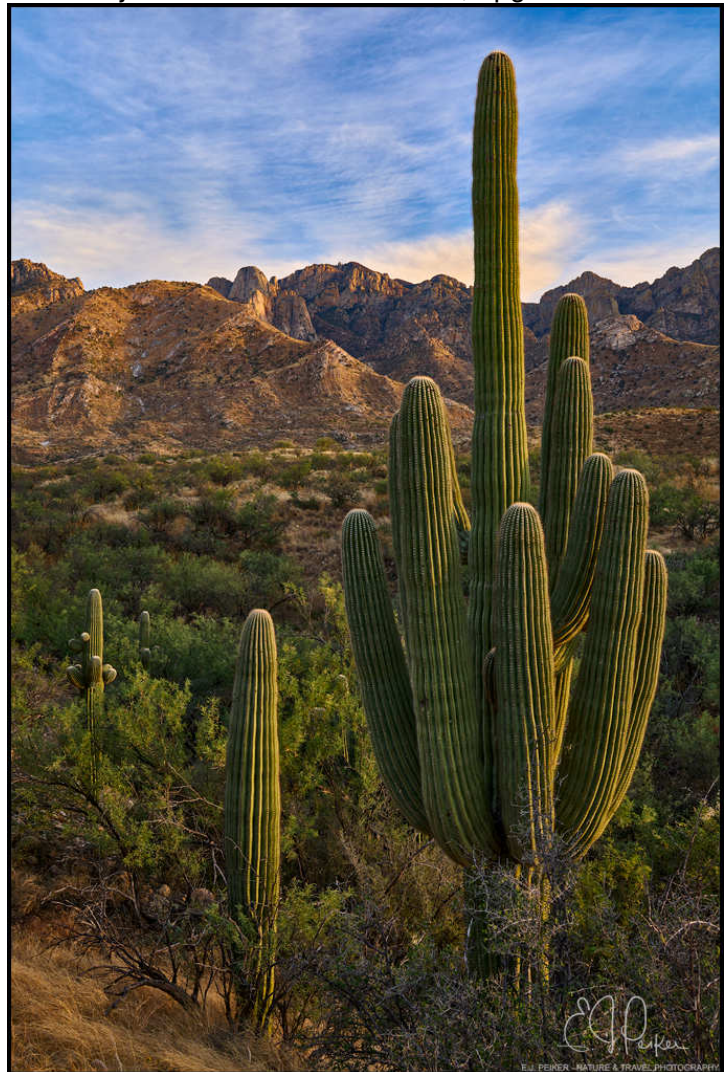
Catalina Mountains (a7R4, Tamron 28-75mm)

In the field, I noticed a little less focus breathing than its predecessor to the point where it is nearly undetectable. Focus breathing is when the apparent focal length changes as you change focus distance. This is especially