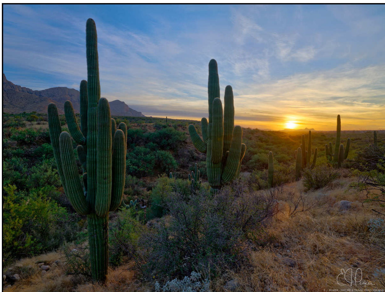
Catalina Mountains (a7R4, 17-28mm)

I continue to be very impressed with what Tamron is offering for Sony photographers by offering exceptional optics in relatively compact packages that are easy to travel and hike with and making the compromises in the right places by eliminating features that most landscape photographers don't need (like image stabilization, arrays of switches and buttons, all metal construction, etc). Demand for these lenses is high and even the used market for these lenses is good if you are selling a lens like the original 28-75 and replacing it with the G2. Traditionally third party lenses have lost a ton of value even when selling something that is as good as new. That has not been the case with these hugely popular Tamron lenses as demand is high.