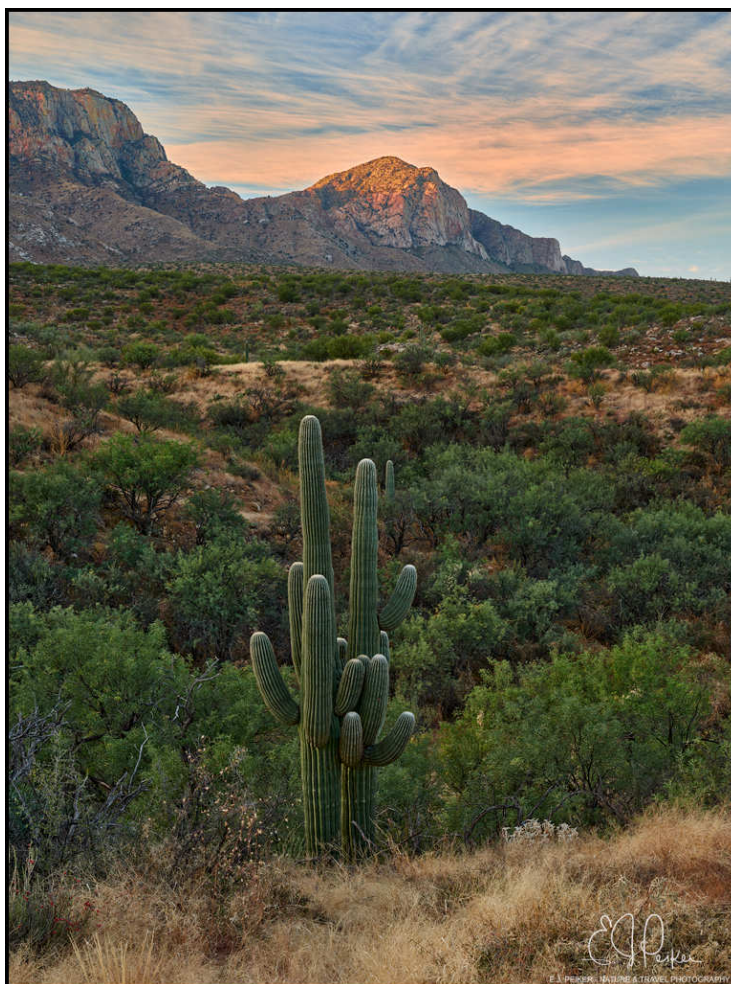
Catalina Mountains (a7R4, Tamron 35-150mm)

Late in 2021, Tamron added a completely new lens to its Sony full frame mirrorless lens offerings – the Tamron 35-150mm f/2-2.8 Di III VXD. This is a completely different lens than the “holy trinity” trio that I have been covering over the last three years. It is a larger, heavier, faster and higher zoom ratio lens. But it is not like the budget oriented but highly versatile 24-300super-zoom lenses that sacrifice optical quality for size, weight and convenience. This is a professional grade optic built like a tank. It is large and heavy, extremely weather-sealed and very fast at f/2 on the wide end. This lens, due to its fast f/2 aperture cannot get away with the smaller 67mm filters and instead uses 82mm filters. It has two programmable buttons, is USB programmable and upgradeable, has much more metal in its build than the other Tamron Sony FE mount lenses and includes an AF/MF switch and zoom lock and a switch that can be programmed with three different custom modes by hooking the camera up to a computer and changing many different aspects of the lens to your liking including focus direction, ring function, focus throw, minimum and maximum focus ranges and more.