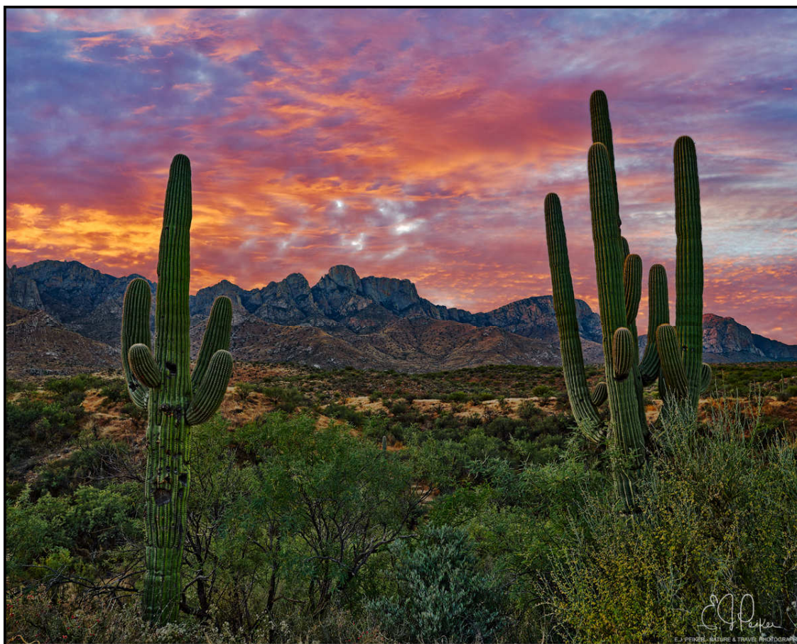
Santa Catalina Mountains (GFX 100S, 32-64mm)