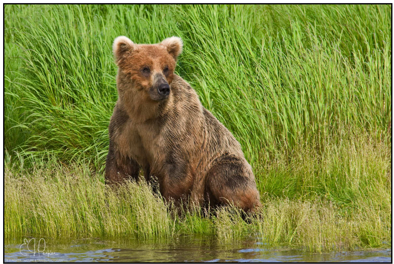
Coastal Brown Bear, Alaska (D300, 500mm)

Sony 12-24mm f/2.8 GM – no other ultra-wide zoom even comes close – I wish it could take filters that don't double the size of your backpack!