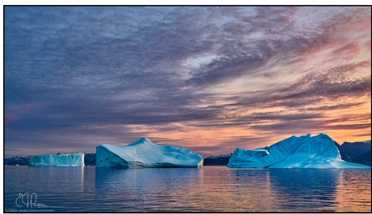
Greenland (a7R3, 24-70mm)