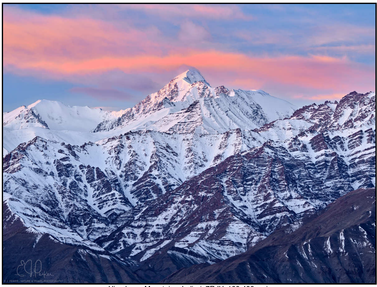
Himalayan Mountains, India (a7R IV, 100-400mm)