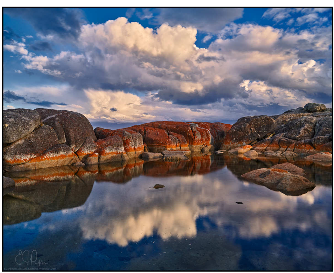
Tasmania (a7R IV, 24-70mm)