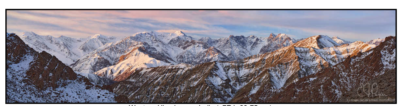
Western Himalayas - India (a7R4, 28-75mm)