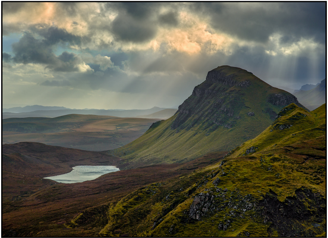
Quiraing, Scotland (Phase One 645DF+, IQ280, 80mm f/2.8)