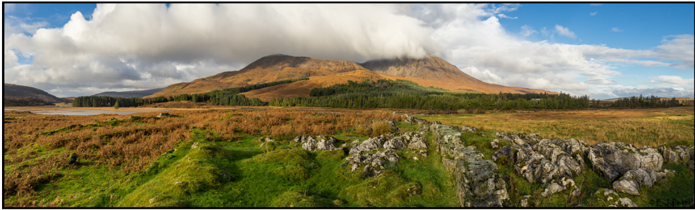
Red Cuillin, Scotland (Sony a7R, 24-70, stitched verticals)

Legal Notice: The text and photographs contained herein may not be copied or reproduced without written consent. This newsletter may be forwarded without restriction unaltered and in its entirety only.