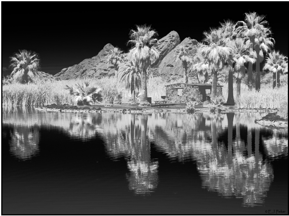
Papago Park, Sony a7R, 24-70mm, 850nm IR simulation

seeing a scene. I do plan on having a camera converted to