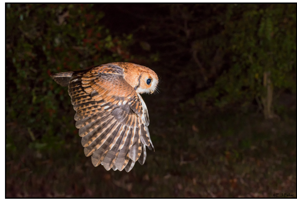
Red Eastern Screech-Owl, D810, 85mm

challenging. I was very pleased with the National Monument and the new lens. I have written a mini review of the lens below.