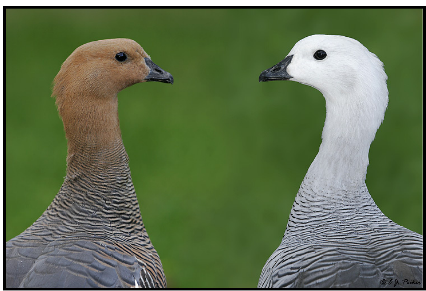
Upland Geese - Original Version

In the Spring 2007 Edition of Quack (<a href="http://www.ejphoto.com/quack 2 07.htm">http://www.ejphoto.com/quack 2 07.htm</a>) I gave you an excellent way to add canvass to a photograph that might have the subject a bit too large in the frame. Photoshop CS4 brings us a new way to accomplish this task, or any other task that requires adding some space, with a function called Content Aware Scaling (CAS). This is a trick piece of programming that allows you to stretch a photograph and the algorithms differentiate what is detailed subject from what is background and then attempts to only stretch the background thereby leaving the subject alone or affecting it only minimally. The cool thing is that it works to stretch or to shrink things. Try it out. Bring a photo into Photoshop, hit Ctrl-A to select the entire photo and then select Edit > Content Aware Scaling. Now expand or contract the photo – it's magic! Here's an example: