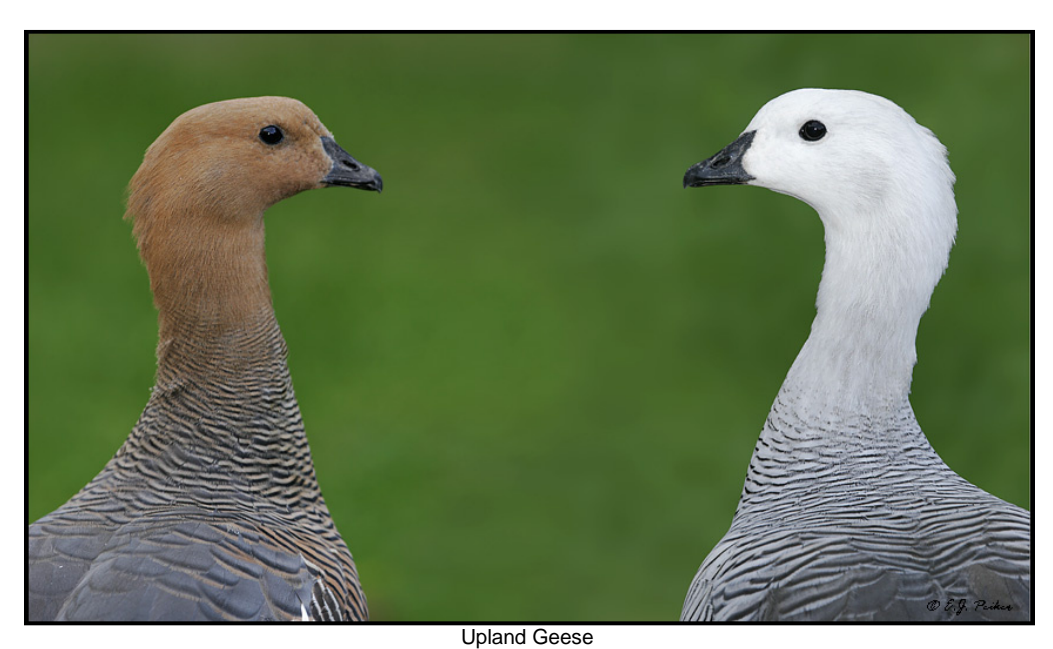
Add Canvas Ctrl A Edit Content Aware Scaling Drag handle outward from side of photo

It works similarly if you just want to add canvas to a subject that is wholly contained within a photo. In this example, it did not stretch the edges because the subject (or content) stretched to the right and left edge. Now that is smart programming. You can select just parts of a photo as well and then use CAS.