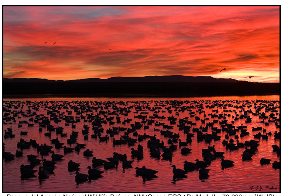
Bosque del Apache National Wildlife Refuge, NM (Canon EOS 1Ds Mark II - 70-200mm f/4L IS)