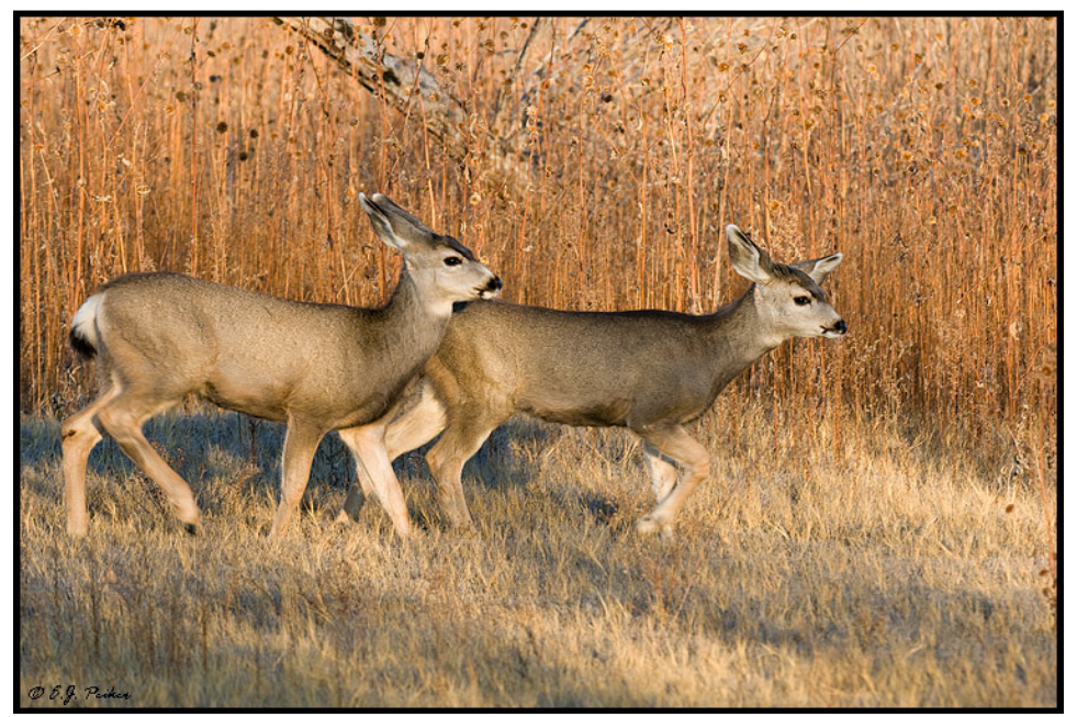
Mule Deer - Bosque del Apache NWR, NM (D300, 200-400mm)

If you prefer doing this the way I showed in my article in Spring 2007, note that the bug in Photoshop that left a thin line at the point of expansion when doing the Free Transform in 16 bit per color mode has finally been resolved by Adobe.