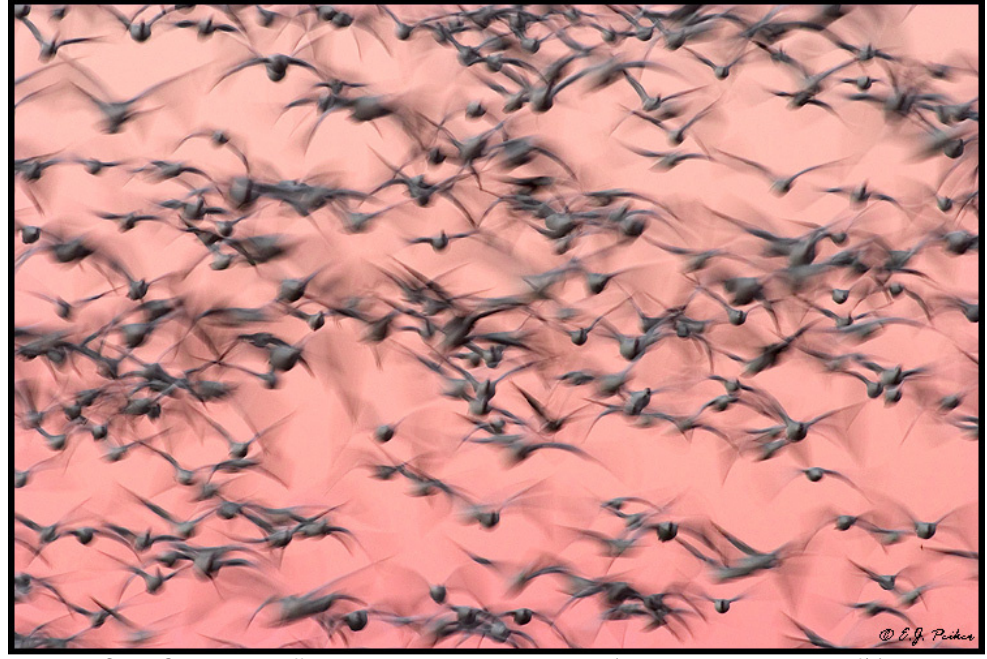
Snow Geese Blast-off – Bosque del Apache NWR, NM (Nikon D300, 200-400mm f/4)

So we have come a long way. Which camera is the best choice for me in the high megapixel game? There are four contenders, the Sony A900, the EOS 5D Mark II, the EOS 1Ds Mark III and the Nikon D3x. The Sony is nice but a bit noisy and has a very limited lens system (although with some exceptional lenses). It is just not fully up to pro body standards. The Sony is therefore not an option for me. The EOS 5D mark II is basically a three plus year old EOS 5D with a different sensor and live view. The AF was poor at introduction of the original 5D and by today's standards is prehistoric, especially in a $3K camera. Plus, once again Canon has introduced a product with some relatively serious problems that it will have to fix. The 5D is not an option. The EOS 1Ds Mark III has excellent picture quality but the same suspect autofocus system as it's lower megapixel EOS 1D Mark III predecessor. It also does not have a high speed crop mode. Sure you can crop the photos but you simply can't get a fast frame rate if you need it. The new kid on the block is the Nikon D3x. It has a 24 megapixel sensor and a 10 megapixel high speed crop mode - frame rate in high speed crop mode is a respectable 7 FPS and it maintains 5 FPS even at 24 megapixels (all in 12 bit capture mode). Initial indications are that the image quality is outstanding. AF is the same world leading D3 system. The downside is that it is the only camera without self sensor cleaning.