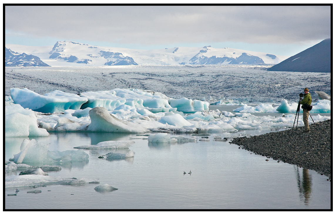
E.J. At Glacial Lagoon, Iceland

bird on a perch. These shots can clutter your bridge window. Here is a neat trick for grouping all of those related images. Simply highlight them all in Bridge and then select Stacks > Group as Stack or even simpler, just hit Ctrl G. A third alternative is to right click the mouse after selecting all of the shots and then picking the Stack > Group as Stack option. You will see all of the images collapse down to one and an extra frame will appear around the thumbnail as well as a number that tells you how many images are in a stack. If you ever want to undo a stack, simply hit Shift – Ctrl G or select Stacks > Ungroup from Stack. This is an incredibly easy and useful tool, especially for those that take multiple exposures or multiple shots that are nearly identical.