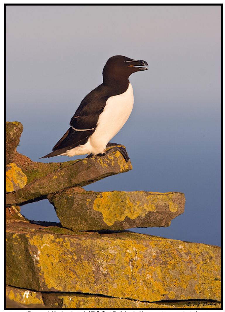
Razorbill, Iceland (EOS 1D Mark IIn, 500mm, 1.4x)