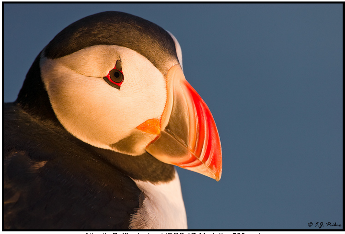
Atlantic Puffin, Iceland (EOS 1D Mark IIn, 500mm)

The next day was Day 9 and it was already time to start making our way back toward Reykjavik as we were starting to get close to the end of our time in Iceland. On the way back we photographed some more beautiful waterfalls and glaciers. We spent another night at the Eldhestar Horse Ranch Lodge and did some more Red-throated Loon photography at the Floi Reserve before heading to Reykjavik the next morning. Once in Reykjavik, we photographed the tame gulls and Ducks in the downtown pond called Tjorn and then bid adieu to those leaving that day. Some of our flights, including mine were the next morning so we got an opportunity to ride around Reykjavik, looking for other birds and getting a feel for the town. An evening walk and dinner in downtown Reykjavik brought the trip to a close.