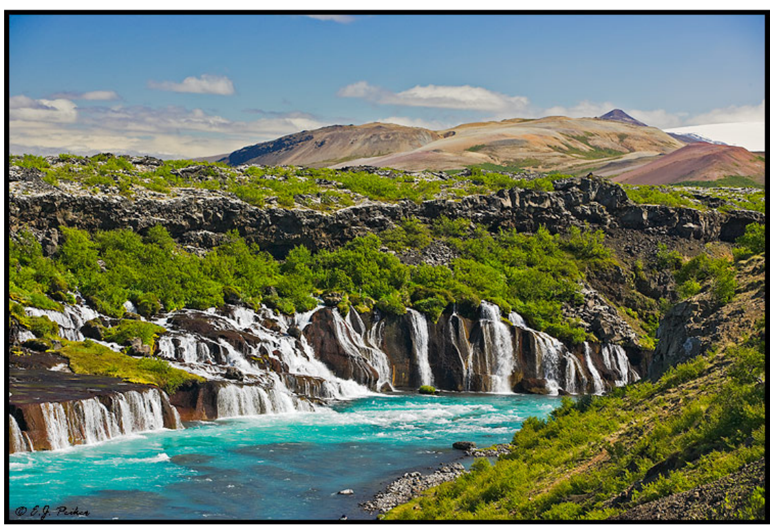
Barnafoss, Iceland (EOS 1Ds Mark II, 70-200mm)