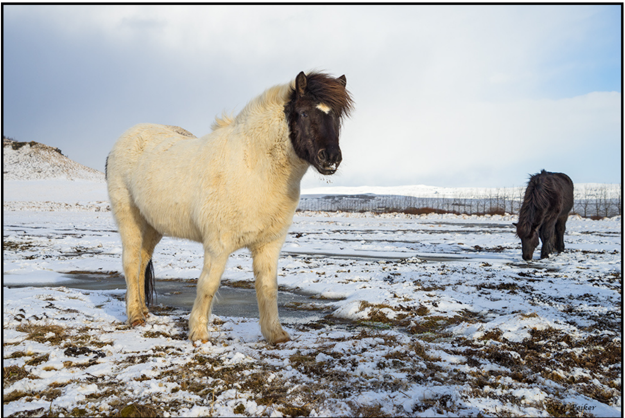
Icelandic Horse - Iceland, (Sony a7R, Zeiss 24-70mm f/4)

Overall, my experience with the a7R in Iceland was a very good one. The camera shot through three hurricane force windstorms, a blizzard, rain, and just about any nasty condition you can throw at a camera. It just kept on ticking. It took great shots with both the autofocus native E-mount 24-70mm lens and my Nikon mount lenses from 14mm to 200mm. The only real issues were the battery life and the mist spec on the eye detection sensor. I think my summer trip to iceland will result in better battery life since the temperatures will likely be about 20 to 30 degrees warmer. I will fashion a small tool that can easily clean the eye detection sensor for future shooting situations in mist - something like a tiny pec pad over a coffee stirrer should do the trick. The Sony 24-70 f/4 lens' image stabilization works wonders in the strong gusty Iceland winds. The Sony 70-200 f/4 is just becoming available and a Zeiss 16-35 f/4 or similar will be