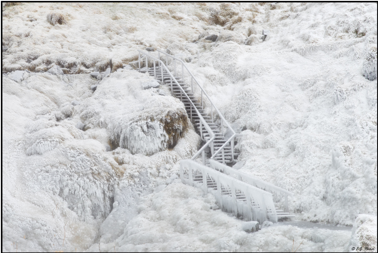
Seljanlnads Foss - Iceland (Sony a7R, Nikkor 70-200 f/4, Novoflex adapter)

there is not real easy but once I was able to dab the sensor with the corner of a lens cloth, operation