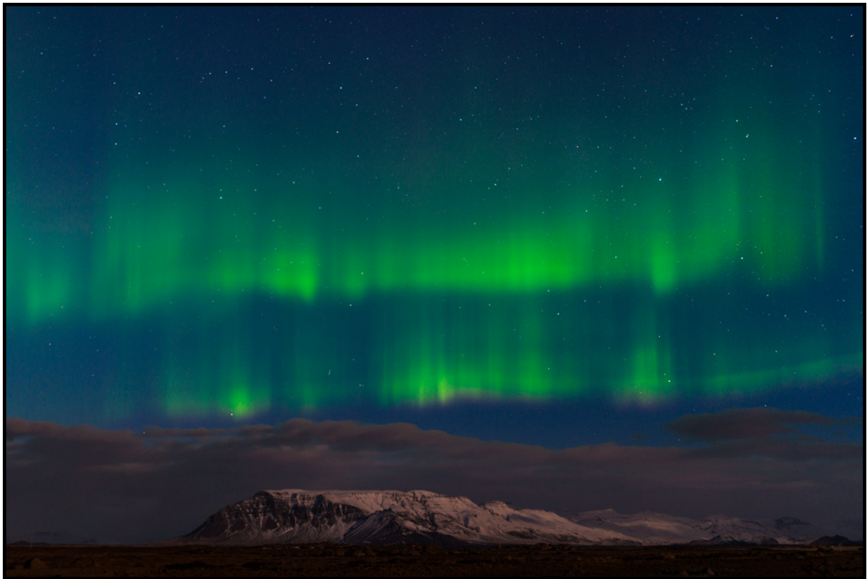
Aurora Borealis - Snaefellsnes Peninsular, Iceland (Nikon D800E, Sigma 35mm f/1.4)