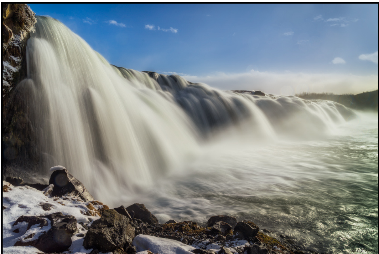
Faxi Foss - Iceland (Sony a7R, Zeiss 24-70mm f/4)