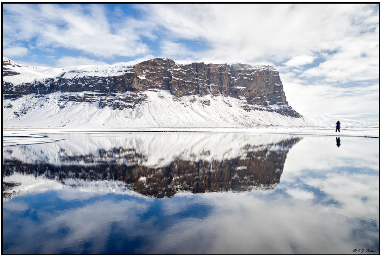
Nupstadur - Iceland (Sony a7R, Zeiss 24-70 f/4)