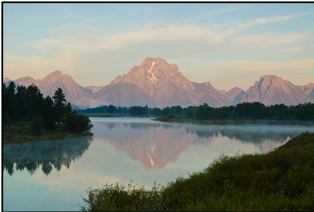
Mount Moran at Oxbow Bend- original version (EOS 1Ds, 24-70mm)

So if you are sitting at home on a rainy weekend, maybe looking at some old photos through the eyes of the newer tools and your improved skills might put a smile on your face.