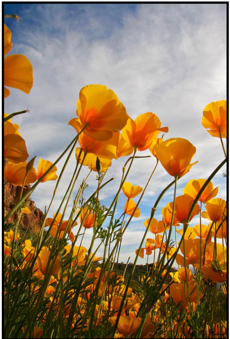
Usery Mountains,- Arizona (EOS 1Ds Mark II, 16-35mm)

Note that the lens without any teleconverter beats all combination that use a teleconverter at any aperture. The older TC-20E II is