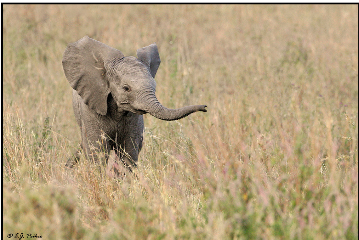
African Elephant Baby - Serengeti, Tanzania (EOS 20D, 500mm)

The text and photographs contained herein may not be copied or reproduced without written consent. This newsletter may be forwarded without restriction unaltered and in its entirety only.