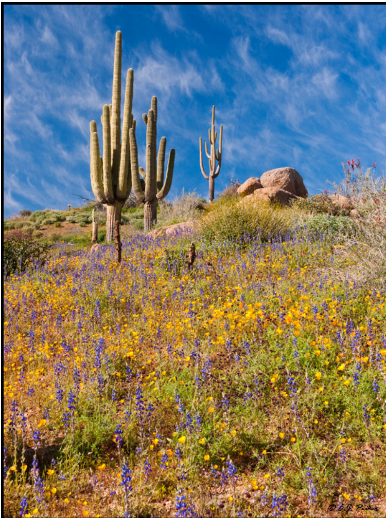
Desert Wildflower Bloom - Bartlett Lake, Arizona

The "landscape" for the photographer that travels has changed dramatically in the last 10 years in the wake of terror threats and continuing profitability issues and poor business management by airlines. Air carriers are continuing to make it more and more difficult to get a camera and lens kit, sometimes worth as much as $30,000 on board. While the restrictions in the USA are still relatively mild compared to the rest of the world, many foreign carriers now have weight restrictions for what you can bring on board as low as 5kg but 7-10kg is more typical. You simply can't get your expensive gear on board if this is enforced. As a result we either have to smooth talk our way on the plane with the gear, or trust that the baggage handling system or the people running it won't damage or "lose" your expensive gear.