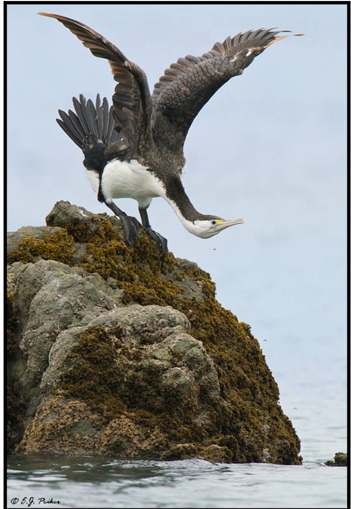
Pied Shag - New Zealand (D300, 500mm, 1.4x)

Landscape photographers almost never use their professional lenses at f/2 or f/2.8 and often carry their gear for miles. How about a complete line of professional grade f/4 lenses? Each one would weigh half of what an equivalent f/2.8 lens weighs. Canon has made some excellent inroads in this regard but unfortunately their f/4 line of pro lenses simply is not as good optically as the larger heavier f/2.8 line of pro grade lenses. There is no technical reason why an f/4 lens shouldn't be as sharp or sharper than an f/2.8 lens. Nikon is way behind in lighter smaller aperture pro lenses and just recently introduced the first real entry into this field with the 16-35 f/4 but they chose to add weight to the lens by adding VR to a lens that simply does not need it. There are still no other f/4 pro grade lenses in the Nikon lineup. The manufacturers have not gone far enough in this regard. Just making a smaller aperture lens doesn't really fully deal with the problem. It's time these lenses also incorporated stronger lighter weight materials into their barrels reducing the weight of lenses even further..