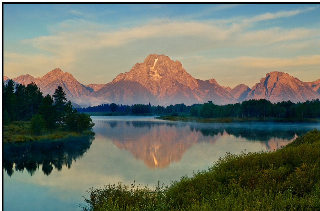
Mount Moran at Oxbow Bend- new version (EOS 1Ds, 24-70mm)