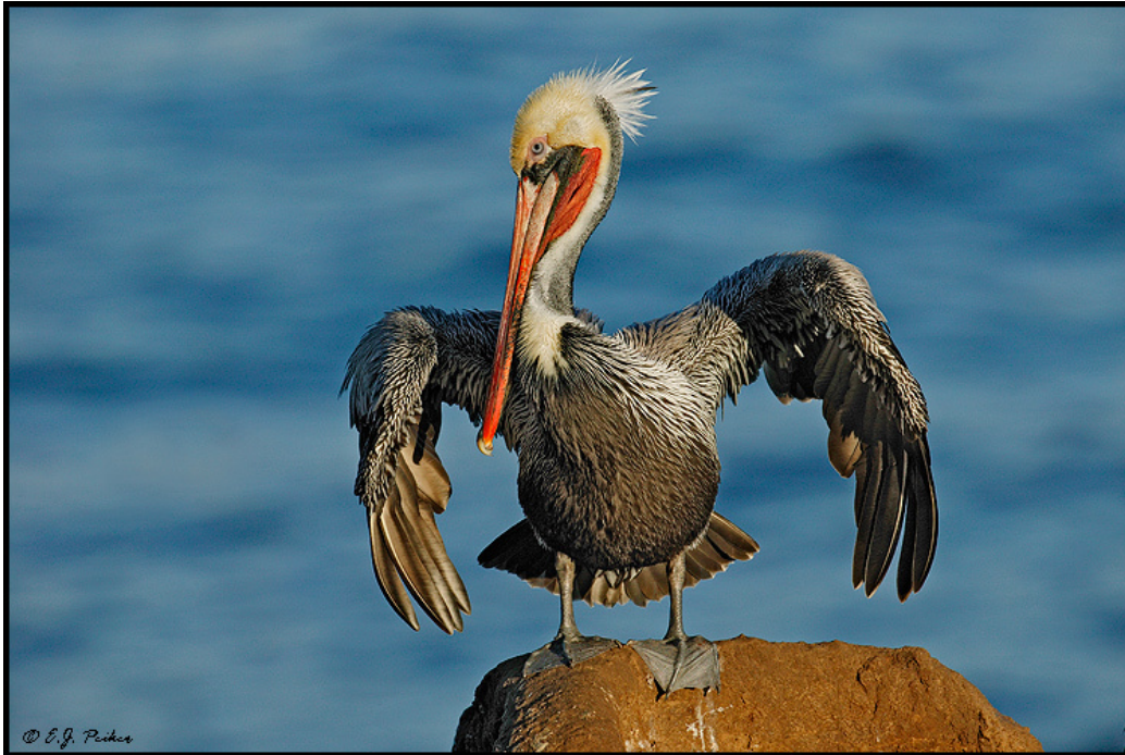
Pacific Brown Pelican, La Jolla, CA (D300, 200-400mm)

If you would like to learn more and see more pictures from this wonderful part of the world, please click on the following link starting on September 21, 2011: http://www.naturescapes.net/workshops/new_zealand_2012