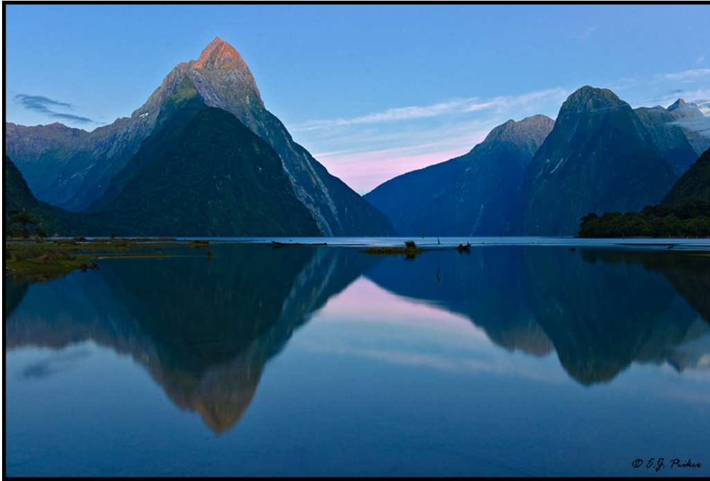
Milford Sound - New Zealand (D3x, 24-70mm)

In just a little over a year I will be leading what promises to be one of the most unique, and dare I say EPIC, workshops I have ever led. Through NatureScapes Certified Workshops, I will be offering the New Zealand experience of a lifetime. This incredible 18 day (16 day in New Zealand plus 2 travel days) will feature both the magnificent landscapes of the South Island and the abundant and beautiful bird life of both the North and South Islands and even Stewart Island. In addition to myself as workshop leader, there will be a local guide and roomy vehicle transportation so that you can comfortably take any and all gear and have it next to you ready to shoot. From various species of Albatross to the world's only Alpine Parrot; from the rarest Penguin on Earth to the beautiful Paradise Shelduck; we will go after them all. From the spectacular 12,000 foot high Mount Cook to Milford Sound ( arguably the most beautiful spot on Earth), to the intimate and unique Moeraki Boulders, we will shoot them all and strive to do it in the best light possible. Air travel between Auckland on the North Island and Christchurch on the South Island, ground transportation, boat charters, and hotel accommodations are included.