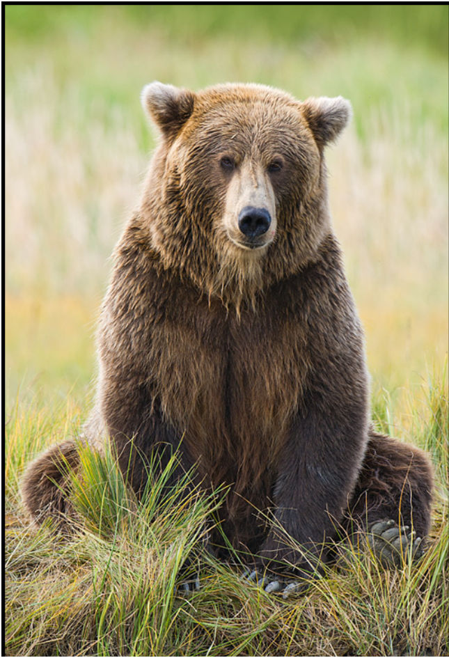
Coastal Brown Bear - Lake Clark National Park, Alaska (D3x, 500mm)

low or mid tide and as soon as you get out of the plane, you may see Brown Bears playing and fishing in the surf. The Coastal Brown Bear is the same species as the Grizzly Bear. They are simply called Coastal Brown Bears if they reside in coastal regions and called Grizzly Bears if they reside in the interior.