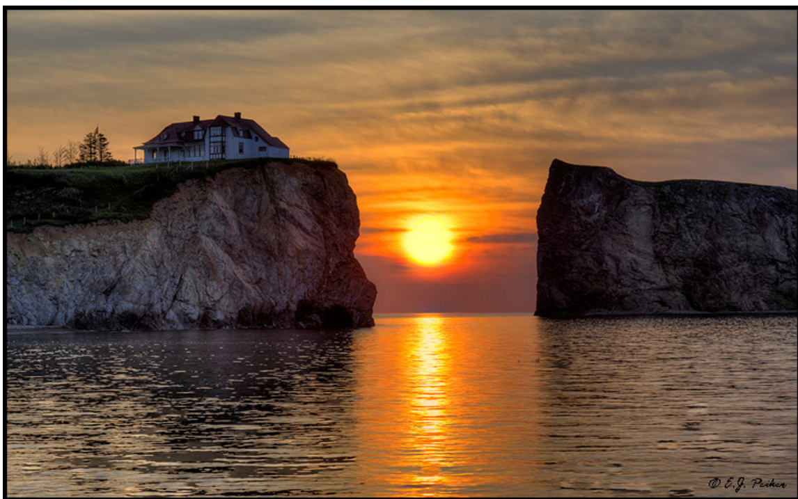
Sea Cliffs - Perce, Quebec (D700, 70-200mm)

Sony made the biggest splash in the August new product announcements with the A77 that boasts a 24 megapixel APS-C (1.5x crop) sensor and uses its translucent mirror technology so there is no mirror slap. This also allows this camera to shoot at a whopping 12 frames per second in certain conditions. How well noise is controlled without losing detail with such small pixels will remain to be seen. I am not optimistic with such tiny pixel sites but early reviews are at least encouraging. Additionally, there is a scaled down consumer version of this camera called the A65 and even Sony's new top of the line mirrorless camera, The NEX 7 sports this same 24 megapixel sensor. Do we really need 24 megapixels in an area that is less than half of a full frame sensor? I wonder! But it is clear that Sony continues to make major inroads and the only thing keeping them from taking a chunk of the high margin professional market is a lack of lens selection, especially when it comes to professional super telephoto lenses.