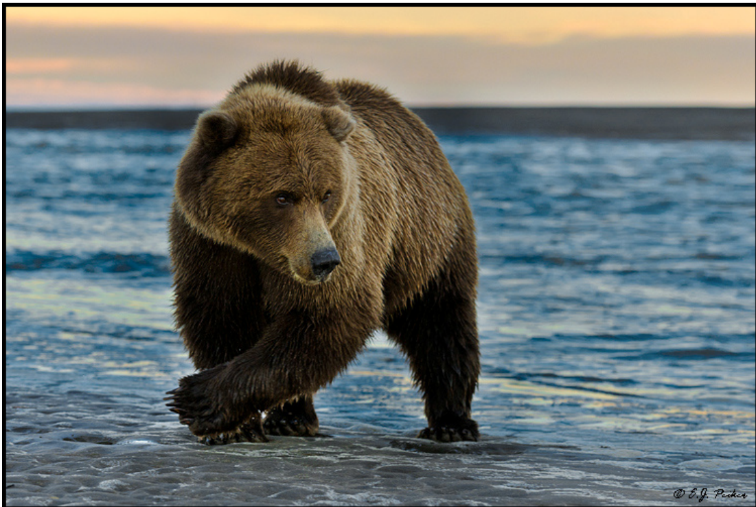
Coastal Brown Bear - Lake Clark National Park, Alaska (D3x, 70-200mm)