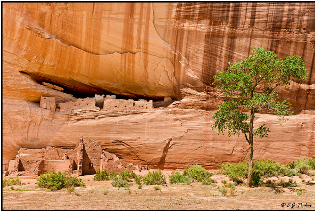
White House Ruin - Canyon de Chelly, Arizona (D3x, 24-70mm)

The question of how I keep up with all of the latest information on the photo industry gets asked often. I pretty much have a daily routine where I look through several websites to ferret out the latest information. This includes many of the rumor sites including nikonrumors.com, canonrumors.com, 43rumors.com, zeissrumors.com, leicarumors.com and others as needed. I religiously read all of the dpreview.com articles, visit robgalbraith.com and bythom.com regularly, and read many other sites as needed. Additionally, I have been in the Nature Photography business for over 10 years now and have made many acquaintances that feed me, often proprietary, information. I also consult with a number of photo and computer related businesses and get early looks at some products. I will, of course, never violate a non-disclosure agreement or talk about unreleased products that I have real knowledge of, even without an agreement until their public announcement or release.