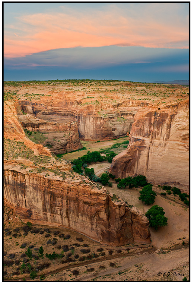
Canyon del Muerto - Arizona (D3x, 24-70mm)

Canyon de Chelly is a canyon that has two primary arteries with a number of veins in each. The Northern canyon is called Canyon del Muerto and the southern artery is Canyon de Chelly. It is administered as a US National Monument on the Navajo Nation. It offers some excellent red rock canyon photography for the landscape photographer. There are a number of good afternoon and morning spots including some excellent ruins. If you are traveling to the popular Monument Valley or Antelope Canyon, make sure you leave time for at least a morning and an afternoon at Canyon de Chelly National Monument. If you have more time, hiring a Navajo guide and going into the interior of the canyon for some close up views of some of the ruins. One can hike to the White House Ruin without a guide and this is a very worthwhile hike with many vistas of the southern Canyon de Chelly. Canyon del Muerto is best in the morning and Canyon de Chelly is best in the afternoon but interesting shots can be made at all times of the day.