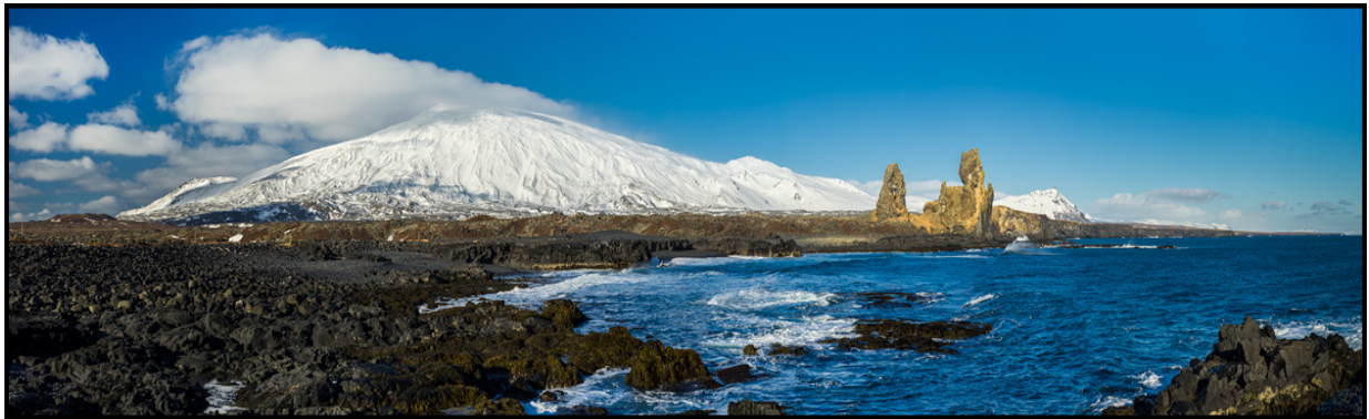
Malarif - Iceland (Sony a7R, Zeiss 24-70mm, 12 vertical images stitched)

Legal Notice: Written and Photographic Content © E.J. Peiker, Nature Photographer. The text and photographs contained herein may not be copied or reproduced without written consent. This newsletter may be forwarded without restriction unaltered and in its entirety only.