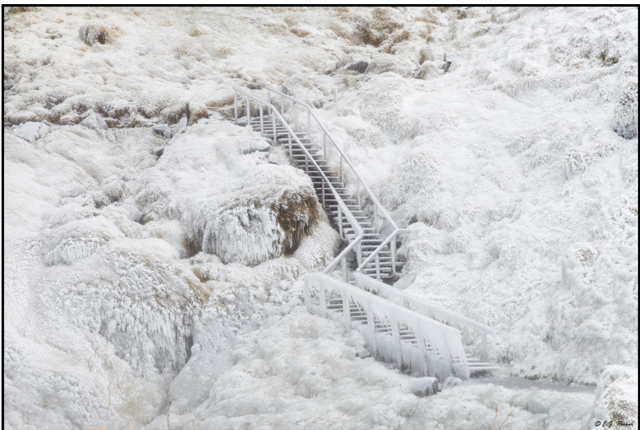
Seljanlnadsfoss - Iceland (Sony a7R, Nikkor 70-200 f/4, Novoflex adapter)