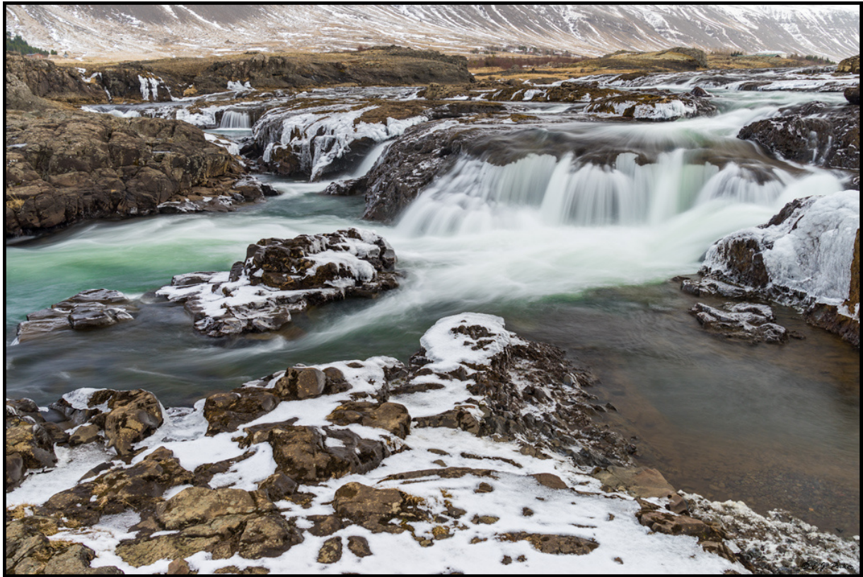
Laxa i Kjos - Iceland (Sony a7R, 24-70mm)

For the complete review that analyzes all of the different lens performance parameters of the Zeiss 24-70mm f/4 lens can be found at http://www.ejphoto.com/Quack%20PDF/Sony-Zeiss%2024-70mm%20Review.pdf