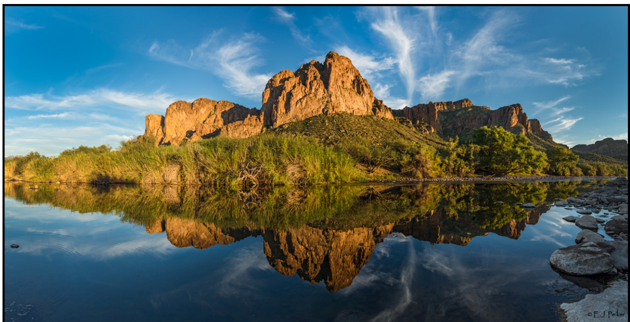
Goldfield Mountains over Salt River (a7R Mk II, 24-70, stacked panorama)

The Sony a7r II ups the ante in mirrorless cameras with its 42 megapixel BSI sensor which retains the same excellent dynamic range and noise levels as its predecessor even though it could even be better if the camera stayed in 14 bit mode all the time and did not use lossy RAW compression. The new camera also addresses some of the biggest issues the original camera had - shutter shock is eliminated with a newly designed shutter and a full electronic shutter option and the poor autofocus system is replaced with one that performs dramatically better and is more accurate than any AF system on any DSLR without the need to calibrate focus with each individual lens. The relatively wobbly lens mount has been redesigned and made rigid. It also comes in an all metal weather-sealed body. As is usually the case, not every complaint of the original a7R has been addressed, most notably the poor battery life and the inexplicable lossy compression of RAW files. But it is an excellent upgrade that really propels this camera to the next level and brings it closer to medium format territory than any other camera on the market in a smaller form factor than full frame DSLRs. My D810 has not been touched since I received this camera!