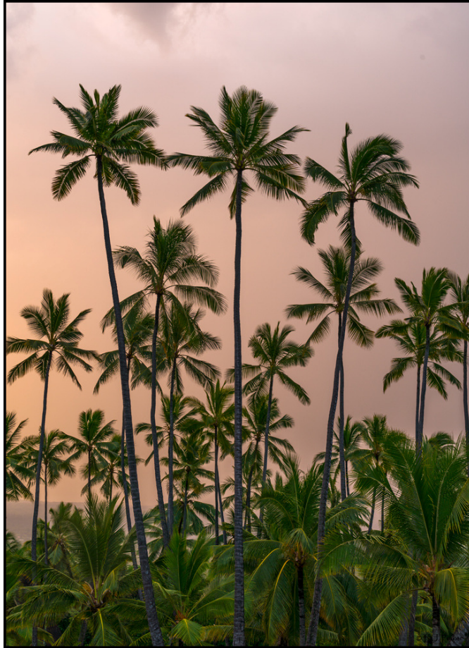
Pu'uohonua o' Honaunau (a7R II, 16-35mm)