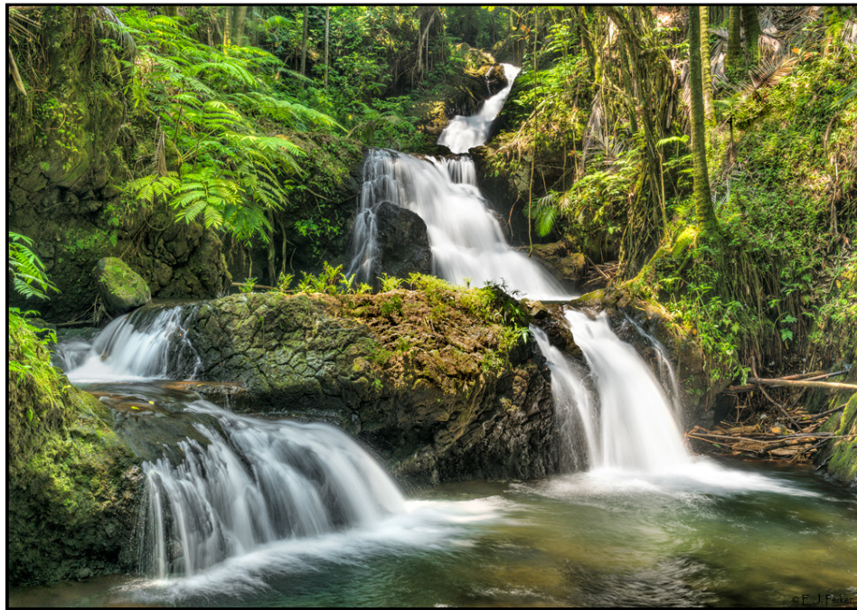
Onomea Falls, Hawaii (a7R Mk II, 24-70mm)

- The internal level in my camera is off by 0.8 degrees. Of all of the cameras I have had with internal levels, this is the first one that is not accurate and there is no documented way of calibrating it.