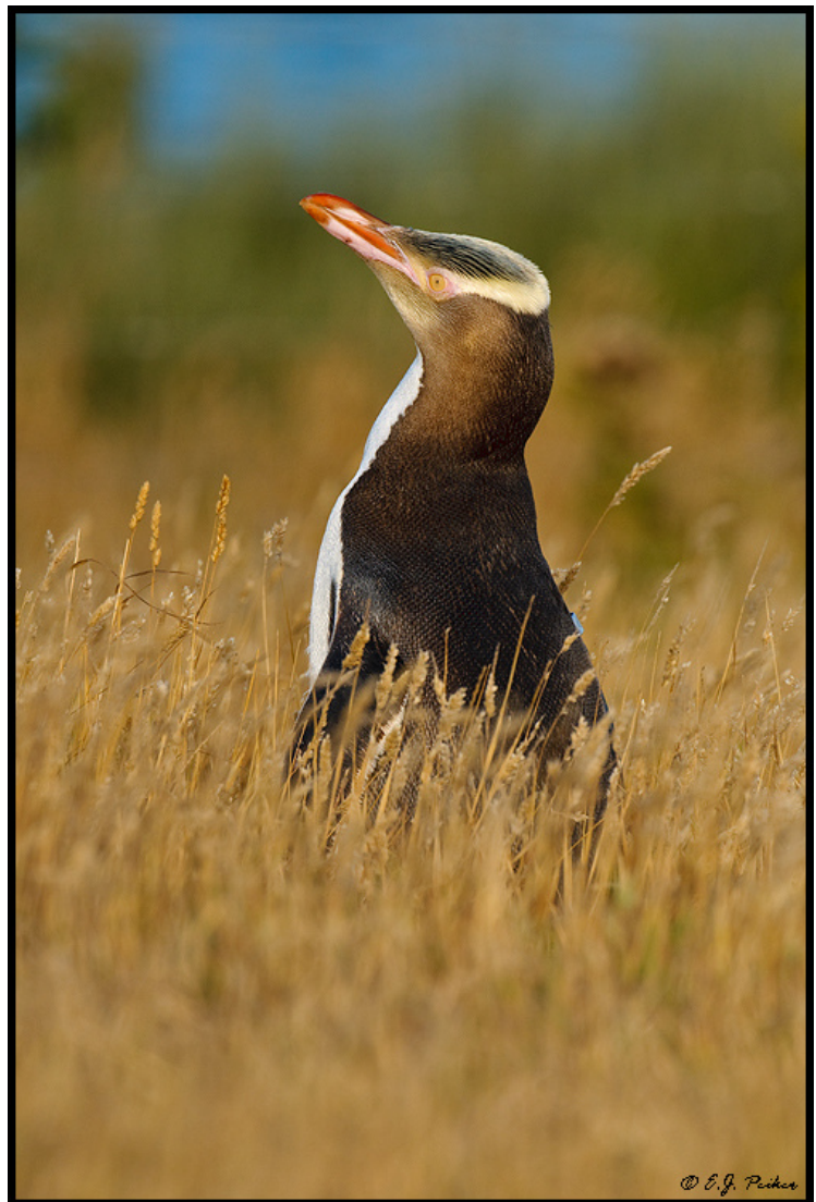
Yellow-eyed Penguin (D300, 500mm)

As we continued eastward, we ran across Lake Waitaki which had the most unreal neon bright turquoise color. It was simply a color that one has trouble believing exists in nature. I made the comment that they must have rounded up all of the world's turquoise food coloring and dumped it in the lake. After a few more side trips that proved to be fruitless photographically we arrived at Moeraki. The primary goal here was to photograph the Round Boulders on the Beach that have been exposed by coastal erosion over the eons. However, prior to going to them, we decided to go out to a lighthouse and much to our surprise, there was a Yellow-eyed Penguin colony there. The Yellow-eyed Penguin is the rarest penguin in the world and has just