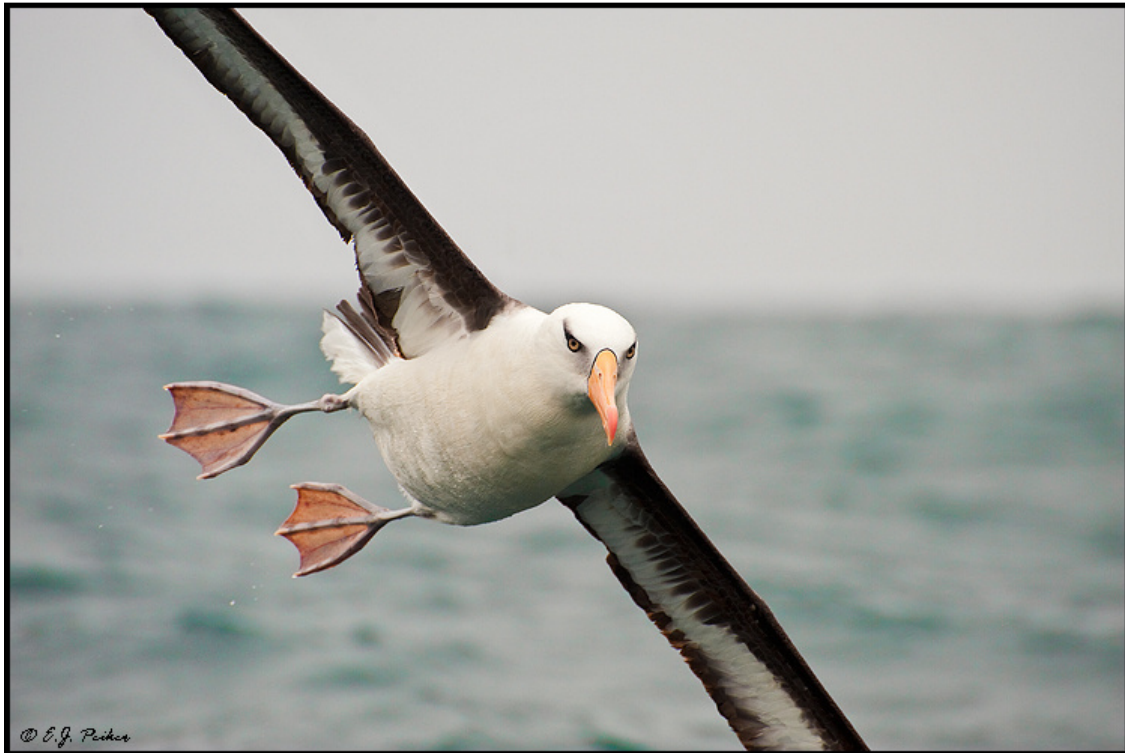
Campbell Island Albatross (Black-browed Mollymawk) (D700- 70-300mm)