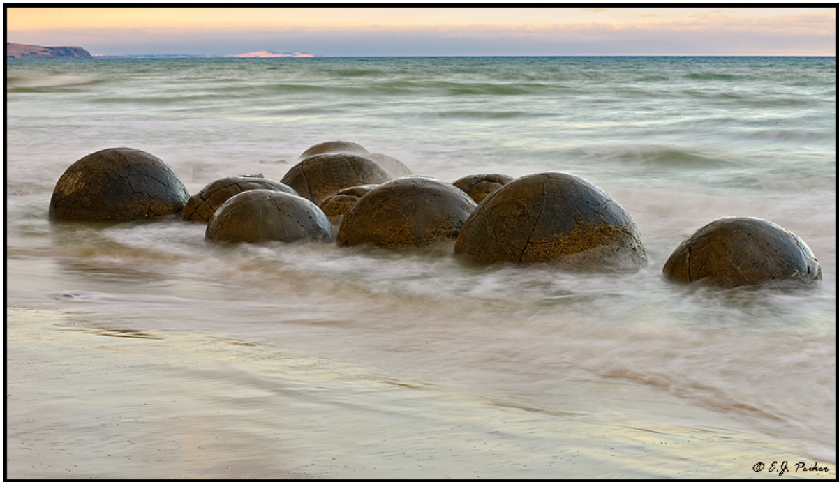
Moeraki Boulders (D3x, 70-300mm)

The wakeup alarm came early again. The goal was to get the boulders with some early morning light on them but this was the first soaked in day. Coastal fog and mist had rolled in so we did more compositional experiments on the boulders with some really long exposures. At times, while waiting for a 20 second exposure to complete, a wave would roll under the tripod legs causing the tripod to shift and ruining the exposure but we still got many great shots.