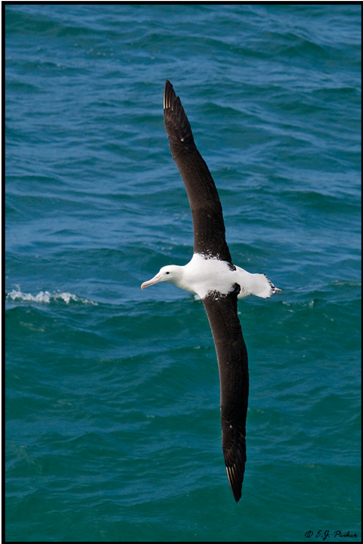
Northern Royal Albatross (D300, 500mm)

just starting to fly – it was great watching them and photographing the tepidly take to flight as youngsters.