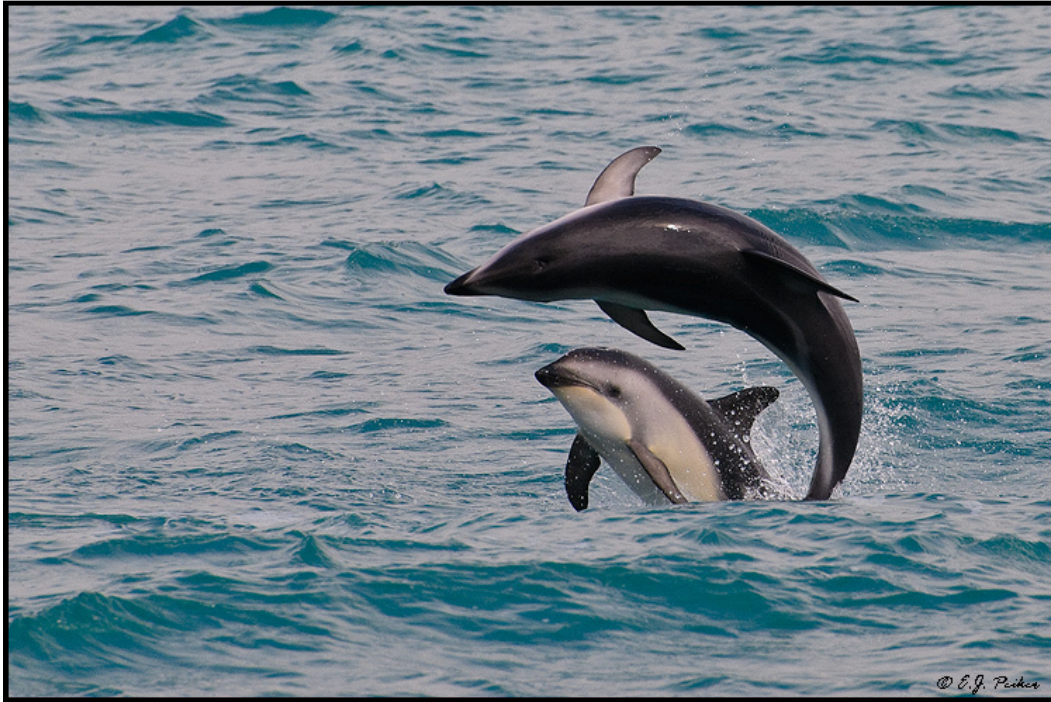
Dusky Dolphin (D300, 70-300mm)

New Zealand is a fascinating and very photogenic country that I definitely want to visit again. I would want to visit closer to Winter to have more snow in the mountains, greener countryside and fewer sand flies. The trip was a fantastic experience and New Zealand is one fantastic country to visit.