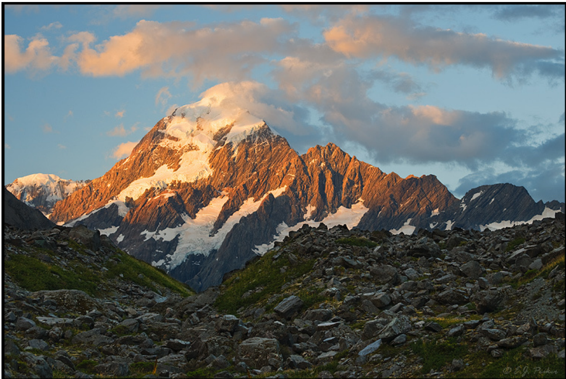
Mount Cook (D3x, 70-300mm)

After checking out of the lodge, it was time to head further west to Aoraki Mount Cook – this is the tallest mountain in New Zealand at nearly 13,000 feet. The route passed the south end of another very large glacial lake called Lake Pukaki. After several stops along the way for scenic photos of the mountains with the lake in the foreground, arrival at Mount Cook Alpine Village and the Hermitage Motel was at hand. Since it was a bit too early to check in, Tasman Glacier seemed like a great place to go. Getting to the glacier is a short but steep hike that results in getting to a high overlook over Tasman Lake – a lake formed by the Tasman Glacier that has some small icebergs in it even this late in the season. On the way up to the glacier overlook, a side trail took us to several small glacial lakes called the Blue Lakes. But they are actually green this time of year.