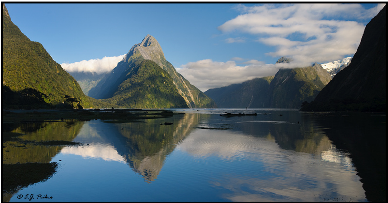
Milford Sound (D3x, 24-70, 4 vertical frames)

We left Te Anau in early morning towards Milford Sound. This is one of the things I have most been looking forward to. Milford Sound is in Fiordland National Park and is actually a fjord, not a sound, since it was carved glacially and I have seen many beautiful photos from the Sound and Mitre Peak. I wanted to photograph it myself. Unfortunately it was a cloudy and overcast day. My hopes are high though that it will get a bit nicer as the day goes on. We stopped at several spots along the way to take photographs. After taking a good 4 hours with frequent stops to drive the scenic 120km we finally arrived in Milford Sound and it looked like the weather just might break. We checked into our chalets at the Milford Sound Lodge – they are beautiful – a luxury chalet with incredible views. In late afternoon we boarded a boat that was largely empty to cruise the Sound. By now it was beautiful and the cruise was easily the best scenic cruise I have ever been on with incredible views of this magnificent fjord. After getting back I was hoping for some color in the sky behind Mitre Peak at sunset and there was some – not great color but good color. I was getting relentlessly attacked by these little flies that bite.