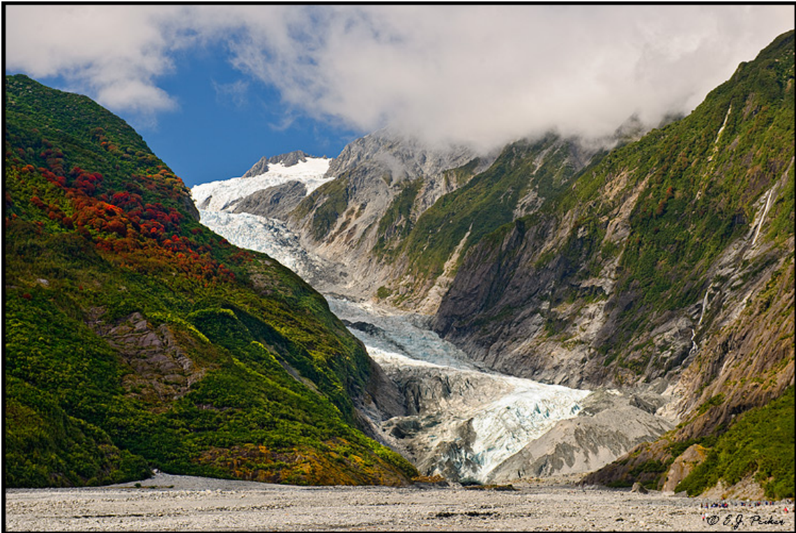
Franz Josef Glacier (D3x, 24-70mm)

It looked like we might get socked in today but the weather cleared in early morning and a hike up to the Fox Glacier followed by an even more spectacular hike to the Franz Josef Glacier made for some very nice landscape shots even though they were not taken in the sweet light of early morning or evening. At the Franz Josef Glacier, one can hike up a hill to get a dramatic overlook of the glacier and its environs. I'm glad I brought that 14-24mm Nikon lens for this.