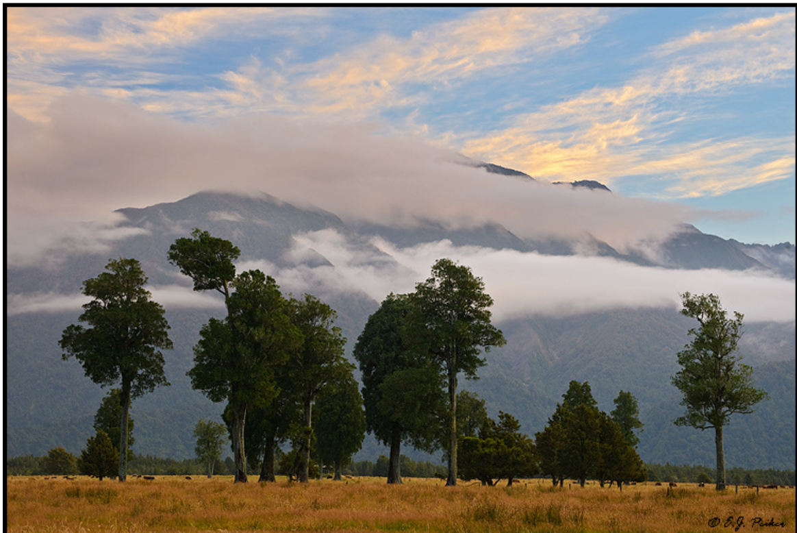
Wetland National Park (D3x, 24-70mm)

After a lunch back in Haast we drove to Fox Glacier, about 150km north in Westland National Park. After check in we drove to Lake Matheson for reflection shots of the glacier but were thwarted by low clouds over it. We were however able to photograph Pukeko (Swamphen) and Welcome Swallows. A hike around the lake was good exercise and took about 1.5 hours. When we got back the skies started to light up at sunset and I took a number of shots of the unique native trees in with some nice pink clouds above.