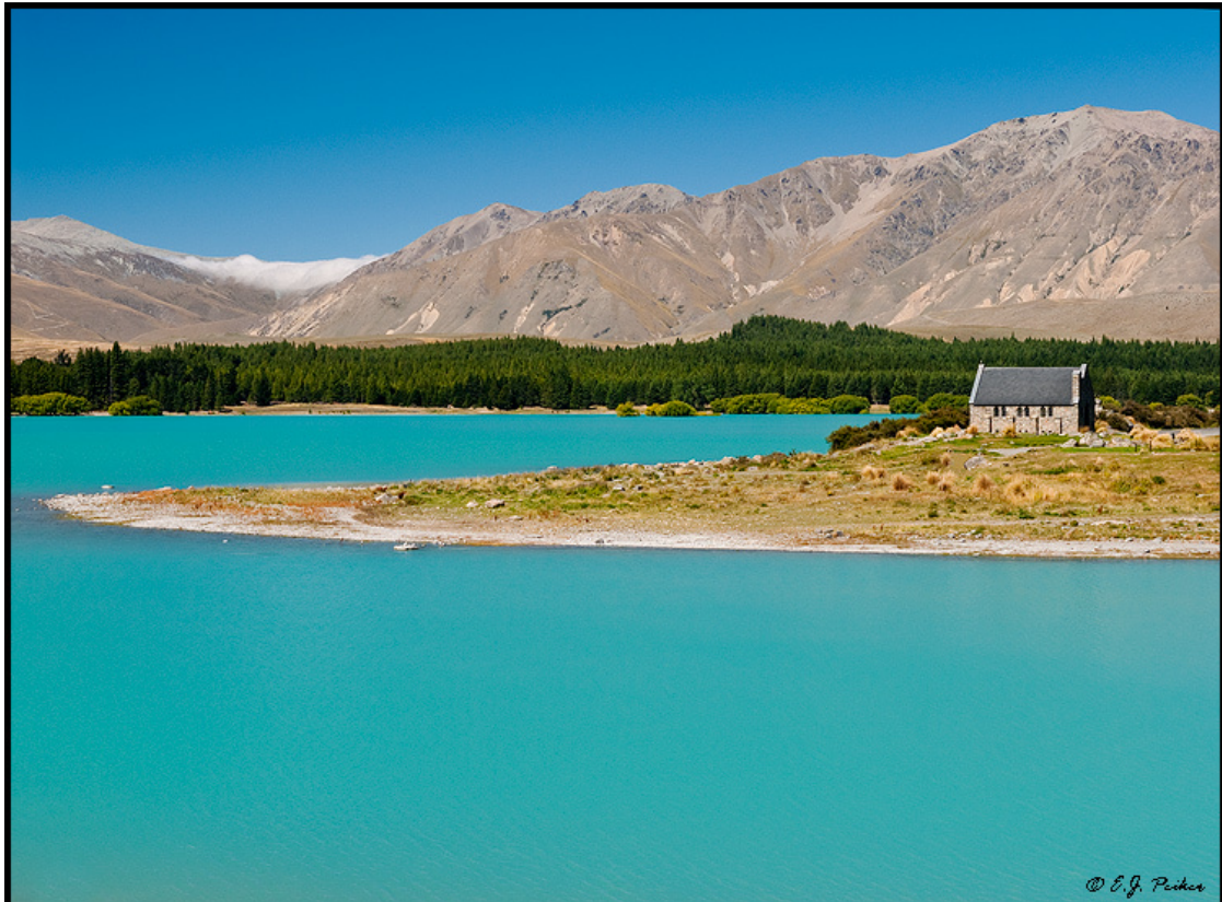
Lake Tekapo (GF1, 14-45mm)

It really felt good stepping outside into about a 70 degree dry and sunny day. A Toyota 4 Runner from Avis was waiting, the little SUV was loaded and it was off to buy groceries and then make way to Lake Tekapo in the center of the island. The south island is approximately the shape of and slightly smaller than the state of California. Driving on the left side of the road was another fear that really turned out to be no problem at all; the only issue I had was that I kept using the windshield wiper lever as a turn signal since the turn signal handle is on the right of the steering wheel rather than the left.