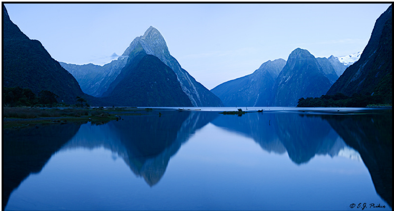
Milford Sound (D3x, 24-70mm- 4 vertical frames)