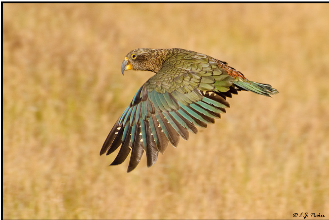
Kea (D300, 70-300mm)

Day 5 started early in the morning with a pre dawn hike back up the first part of hooker Valley to photograph Mt. Sefton with morning alpenglow. A number of good vantage points were found. On the way back, the campground was full of Keas being rambunctious. Keas are the world's only Alpine Parrot. Watching them cracked me up as they were trying to dismantle motor homes in the campground. I witnessed one Kea stealing a pair of underwear off of a clothesline and running away with it. I got some nice shots of these pretty green birds.