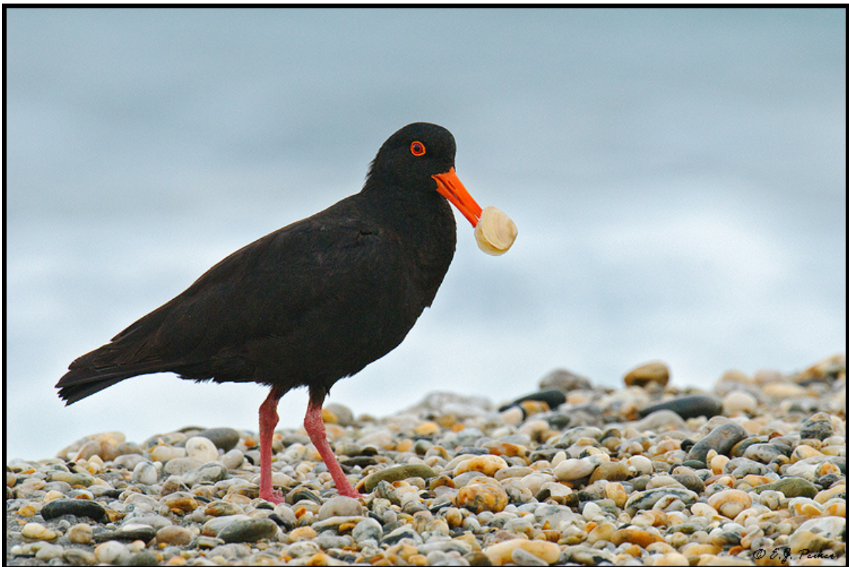
Variable Oystercatcher (D300, 500mm, 1.7x)

After dinner we drove out to Haast Beach where I finally got to photograph a Variable Oystercatcher and even got one with a clam or some other shell fish. It was a bit dark but it was nice to have a cool ocean breeze which kept the sand flies away. There was also a Spur-winged Plover couple and a couple of Shetland Ponies.