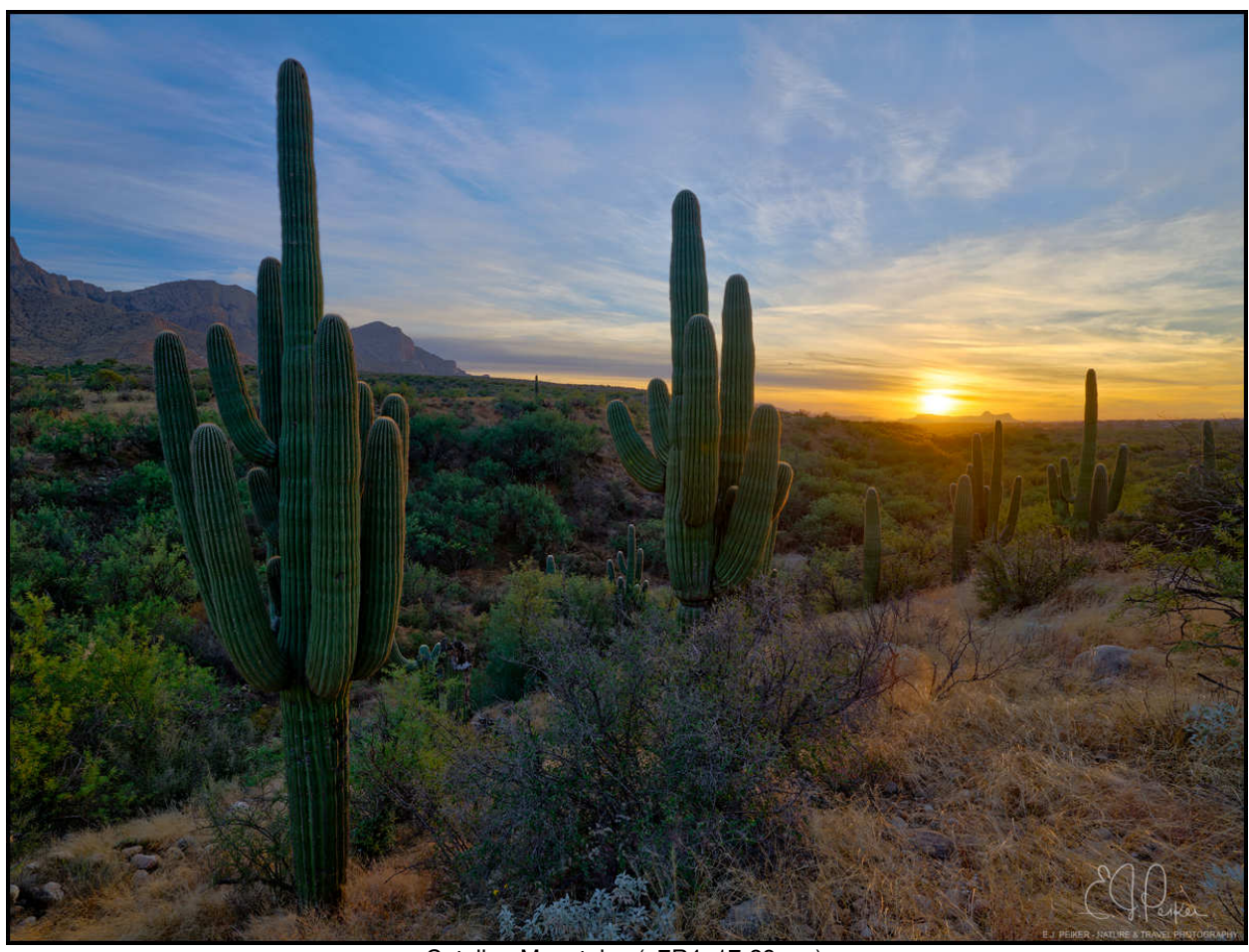
Catalina Mountains (a7R4, 17-28mm)

I continue to be very impressed with what Tamron is offering for Sony photographers by offering exceptional optics in relatively compact packages that are easy to travel and hike with and making the compromises in the right places by eliminating features that most landscape photographers don't need (like image stabilization, arrays of switches and buttons, all metal construction, etc). Demand for these lenses is high and even the used market for these lenses is good if you are selling a lens like the original 28-75 and replacing it with the G2. Traditionally third party lenses have lost a ton of value even when selling something that is as good as new. That has not been the case with these hugely popular Tamron lenses as demand is high.