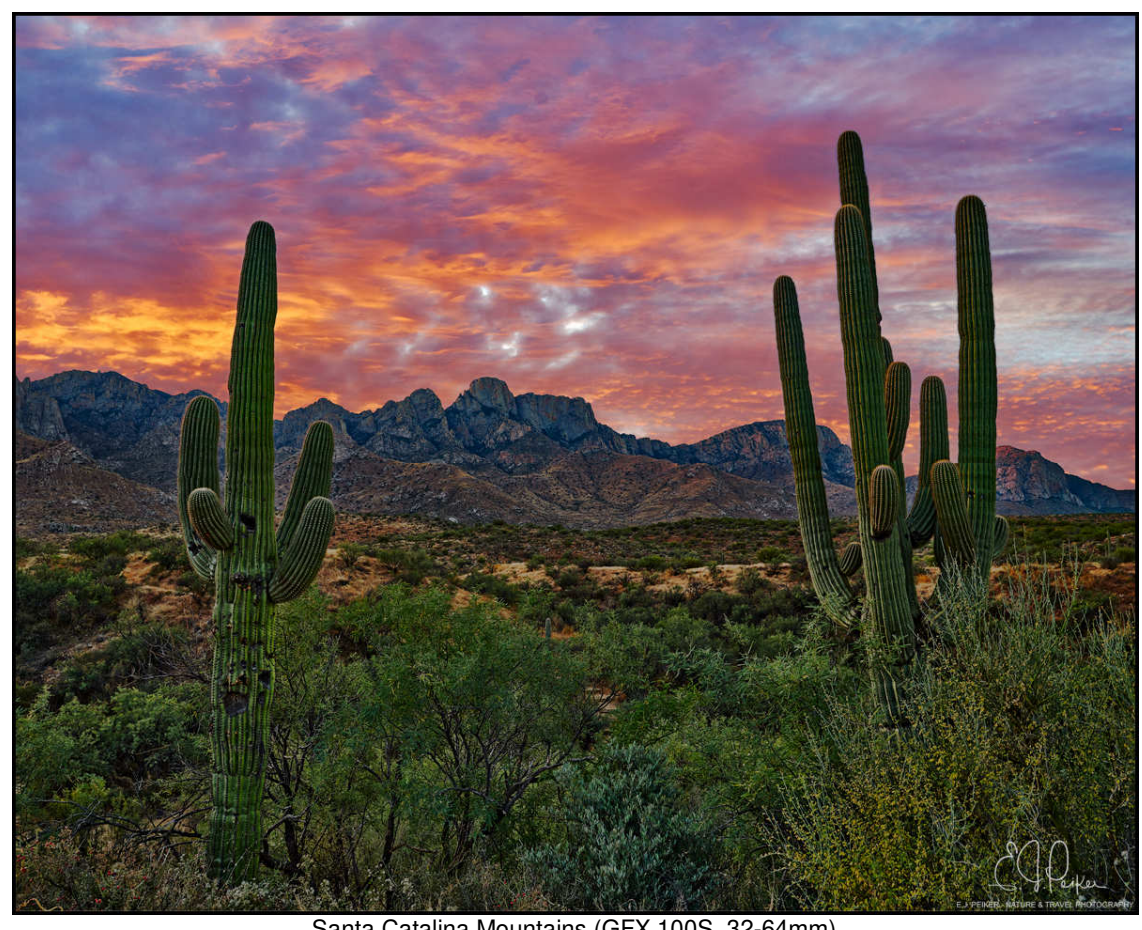
Santa Catalina Mountains (GFX 100S, 32-64mm)