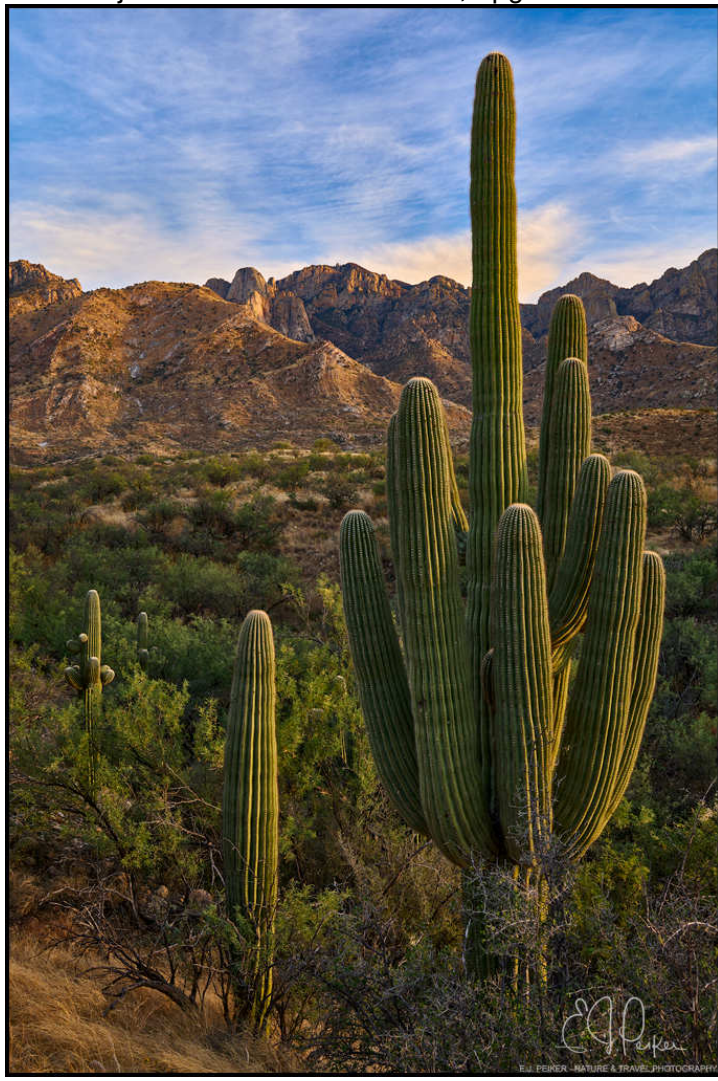
Catalina Mountains (a7R4, Tamron 28-75mm)

In the field, I noticed a little less focus breathing than its predecessor to the point where it is nearly undetectable. Focus breathing is when the apparent focal length changes as you change focus distance. This is especially