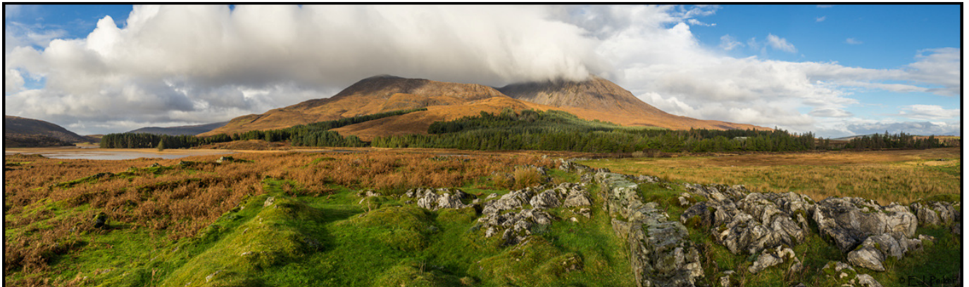
Red Cuillin, Scotland (Sony a7R, 24-70, stitched verticals)