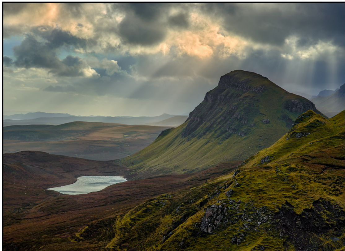
Quiraing, Scotland (Phase One 645DF+, IQ280, 80mm f/2.8)