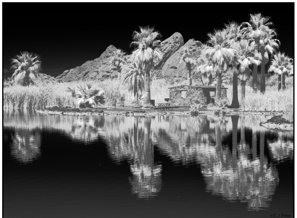
Papago Park, Sony a7R, 24-70mm, 850nm IR simulation

In October, I had a private client that photographs in infrared exclusively. We had a ton of fun doing desert landscapes at some of my favorite local and lesser known spots in south-central Arizona without the crowds that you get in the highly publicized Arizona areas. I don't own an infrared camera but by analyzing many of my client's files, I was able to come up with a very credible simulation although I couldn't match the look exactly. These few days did wet my appetite for some real infrared photography and I got a lot better at "seeing" in Infrared - in other words visualizing what an IR photo would like when