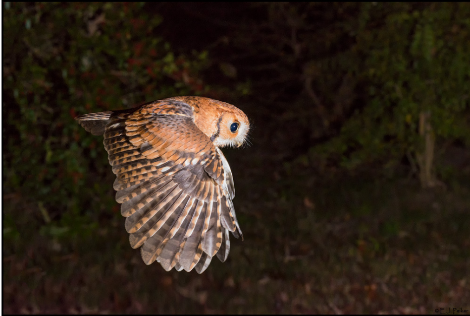
Red Eastern Screech-Owl, D810, 85mm

challenging. I was very pleased with the National Monument and the new lens. I have written a mini review of the lens below.