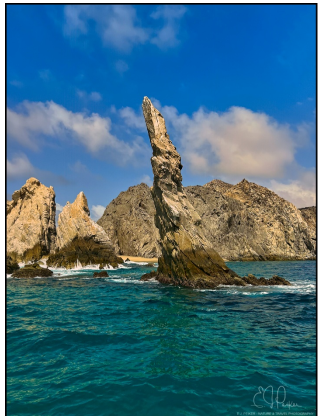
Lands End - Baja California Sur, Mexico

https://eipphoto.com/gear_for_sale_page.htm