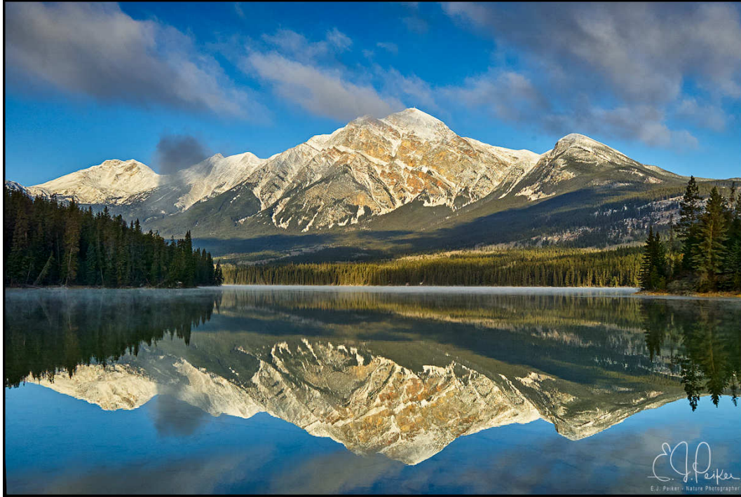
2002 – While attending a Jasper National Park wildlife shoot with Charles Glatzer and Tom Hill in October 2002, I broke away one early morning and did the relatively short hike to the eastern end of Pyramid Lake in Jasper National Park, Alberta, Canada after an overnight freeze and snow at the higher elevations to capture this perfect reflection shot of Pyramid Peak.