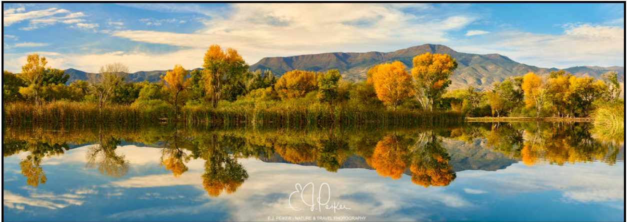
Deadhorse Ranch State Park - Arizona (GFX100s, 32-64mm)

Legal Notice: Written and Photographic Content © 2023 - E.J. Peiker, Nature & Travel Photography. The text and photographs contained herein may not be copied or reproduced without written consent. This newsletter may be forwarded without restriction unaltered and in its entirety only.