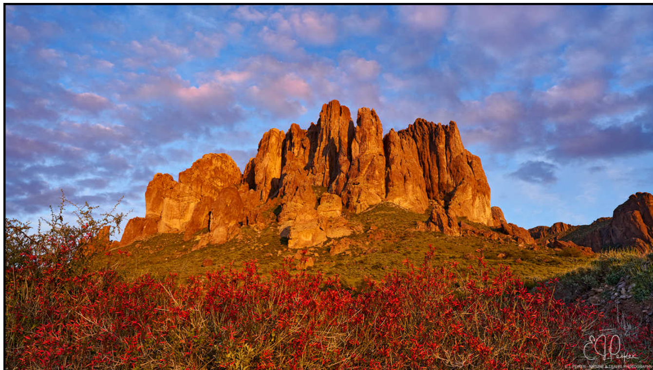
Superstition Mountains – Arizona (a7r5, 17 – 28mm)