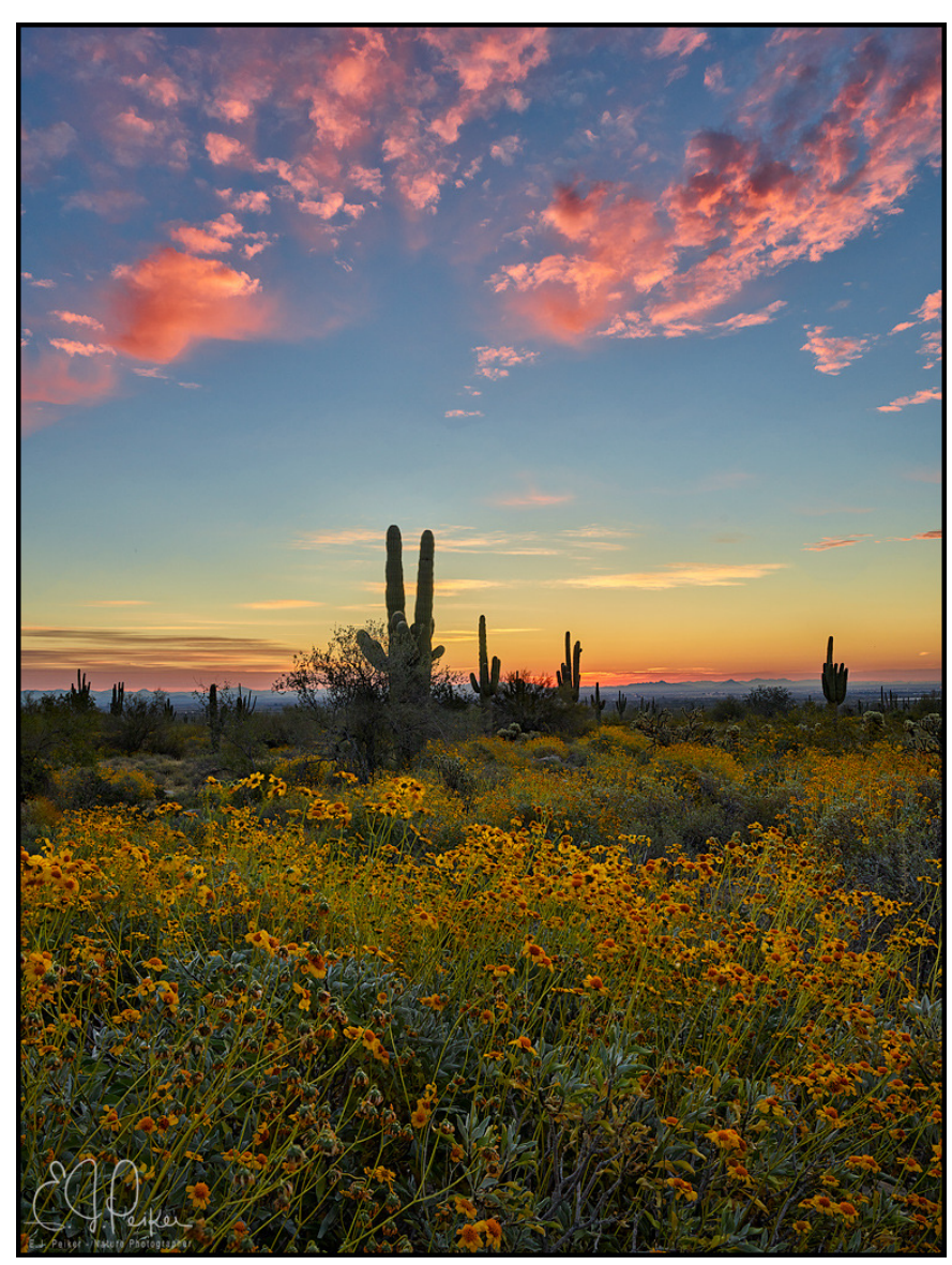
Brittlebush at White Tank Mountain (XF-IQ3100, 40-80mm)

In some areas the Mexican Gold Poppy was spectacular, namely Peridot Mesa on the San Carlos Apache Reservation and Bartlett Lake just northeast of the Phoenix Metro, while other places like the White Tank Mountain Preserve had an exceptional Brittlebush (Encelia) bloom. There were also some spotty outbreaks of Coulter's Lupine and Globemallow