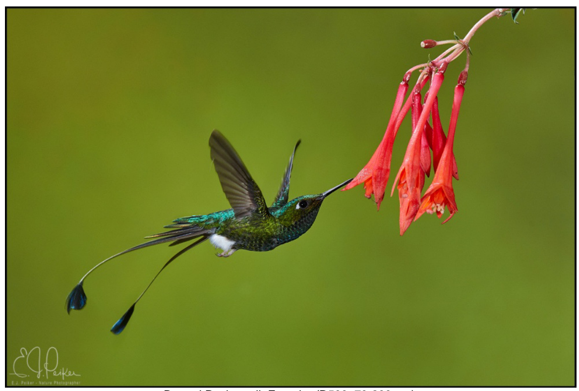
Booted Racket-tail, Ecuador (D500, 70-200mm)