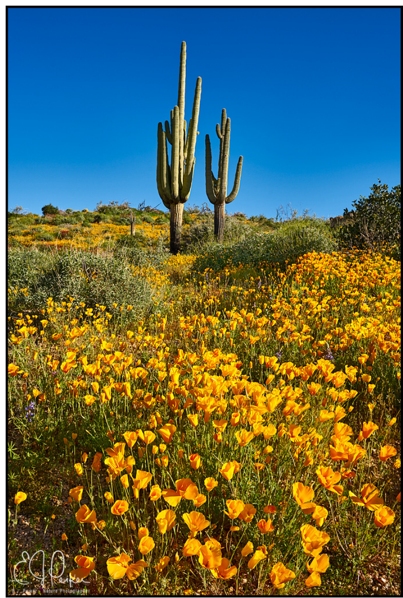
Sonoran Desert in Bloom (Sony a7R Mk II, Zeiss Batis 25mm)