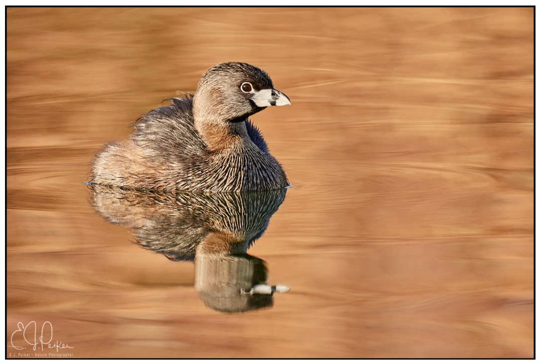
Pied-billed Grebe (D500, 150-600mm)