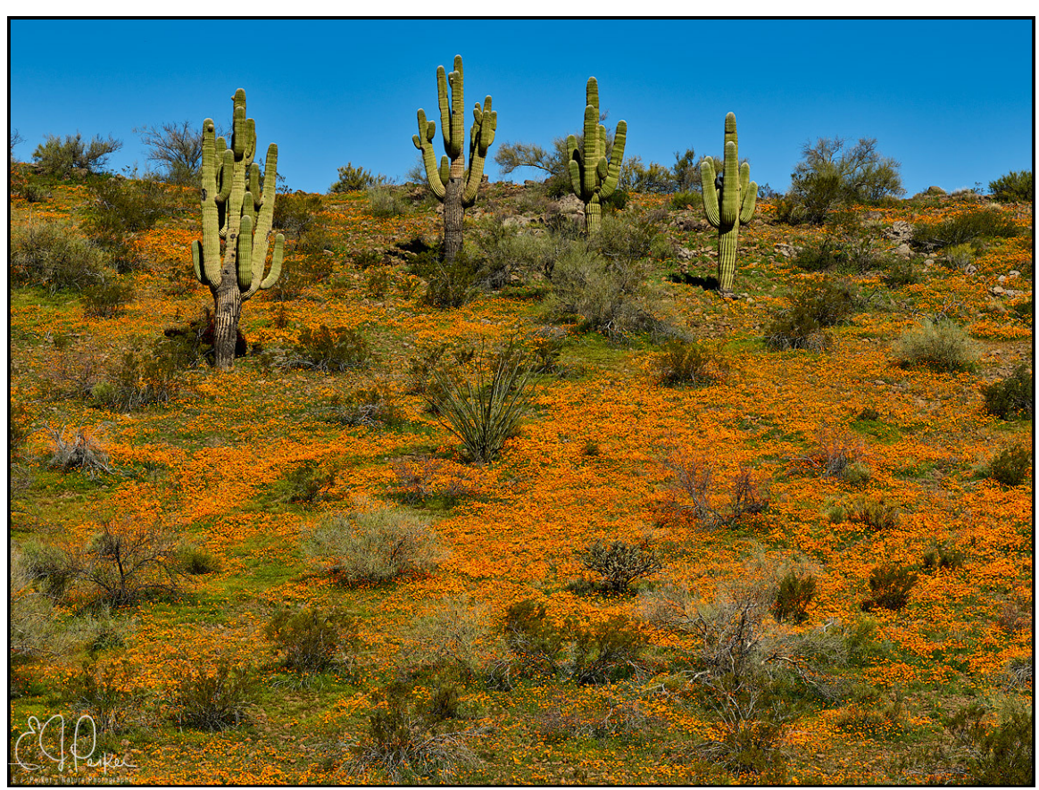
Peridot Mesa in bloom, San Carlos Apache Reservation, AZ (XF-IQ3100, 75-150mm)