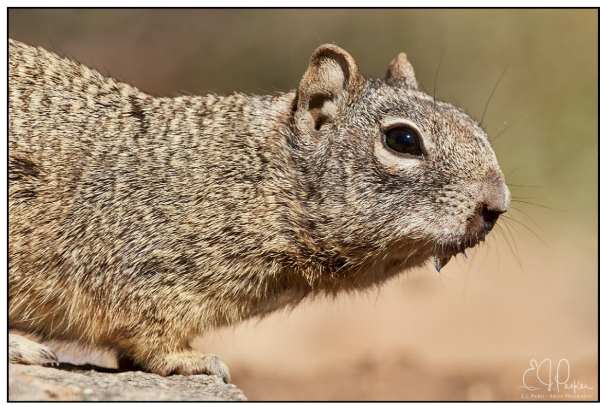
Rock Squirrel (D500, Sigma 500mm f/4)

Nikon VR lenses - namely that if your shutter speed starts to get up towards 1/1000 second, you will get slightly better resolution if you turn OS off but it is really minimal and it requires some pixel peeping to really see any difference. If you do forget to turn it off when it's bright out, it really isn't a big deal. Similar to Canon and Nikon, Sigma says you should turn off the OS prior to a lens change even though few people actually ever do that!