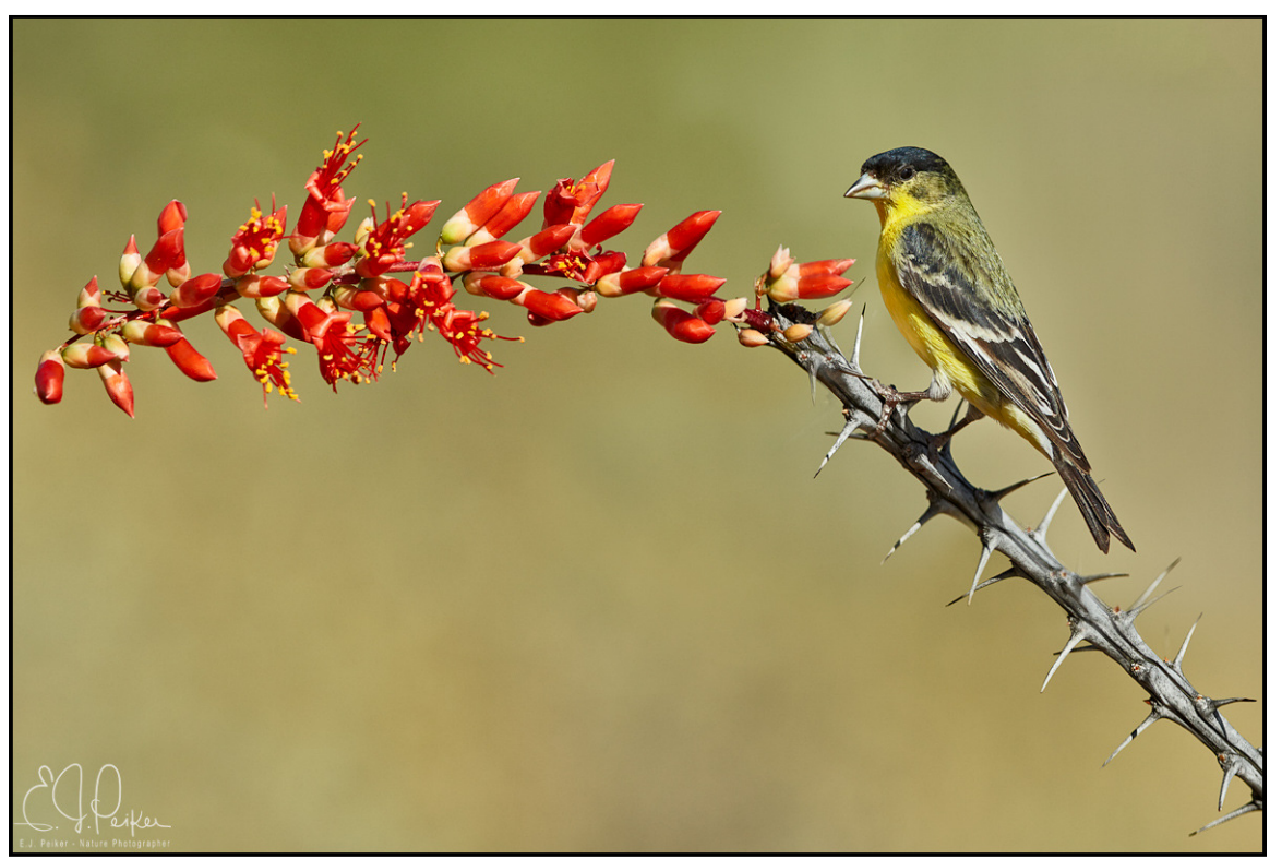
Lesser Goldfinch (D500, Sigma 500mm f/4)

The Sigma 500mm f/4 lens utilizes 16 elements in 11 groups and uses rounded aperture blades for smooth out of focus highlights (bokeh). It uses the most effective Optical Image stabilization in any Sigma to date and has positions for normal use and for panning. It is compatible with the Sigma USB Dock which allows the user to fine tune AF at 4 different AF zone distance settings (compared to just one for Canon and Nikon) and also allows one to fine tune AF speed, acquisition, re-acquisition, stabilization behavior, focus limit range sizes, and update the lens firmware. The new Sigma 500mm f/4 uses a 46mm rear filter which is part of the optical formula and is required for optimal performance. Similar to the other 500mm designs from the