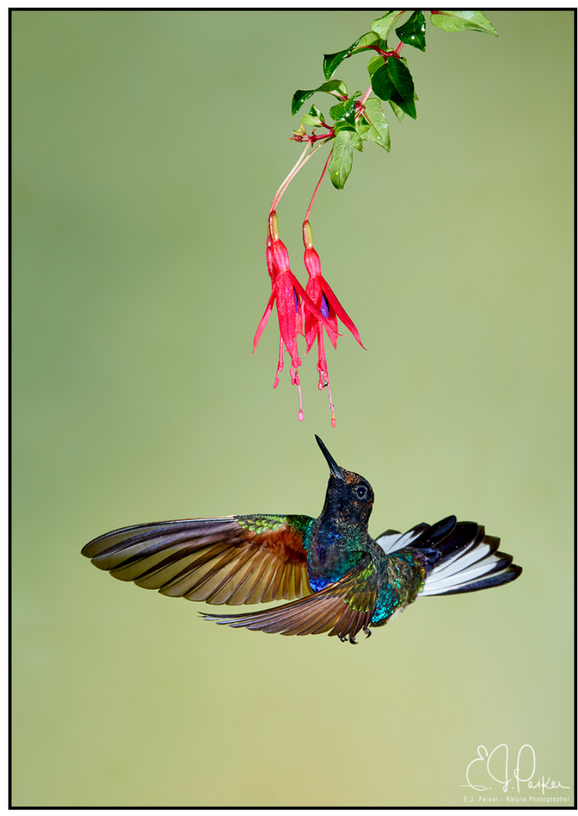
Velvet-purple Coronet - Ecuador (D500, 70-200mm)

There are some things I don't like about the lens. First, the new lens foot has a button release and thumb screw to allow you to