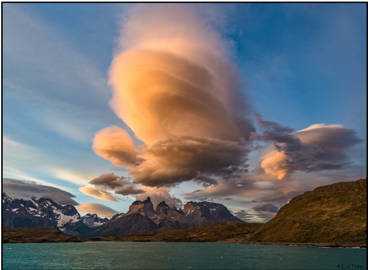
Cuernos del Paine, Chile (Nikon D810, 20mm)