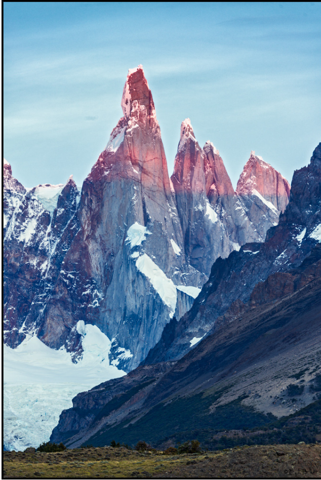
Cerro Torre (D810, 80-400mm)

once saw either mountain during the 5 days that I was there. In fact it was difficult traveling as the area was experiencing historic rainfalls and the roads were rivers. The entire southern Andes were completely soaked in for two weeks. These are some of the most spectacular mountains in the world, photographically speaking, and my anticipation was high so when we awoke the first morning and drove to an overlook and were subjected to 60MPH winds and no mountains in sight, I had a bad feeling of Deja Vu. Fortunately, as the day went on, the weather got better and by evening we were able to take some great shots of both mountains with clouds lit up by the setting sun behind them. Over the next week we did several mountain hikes to various views of these great peaks but we never got good morning light to light up the east face of the mountains. But finally on our last morning, before having to leave early the next day we got a couple of minutes of pink first light at the top of the mountains. The photographic part of our journey was complete. We got to see and photograph everything that we had hoped to.