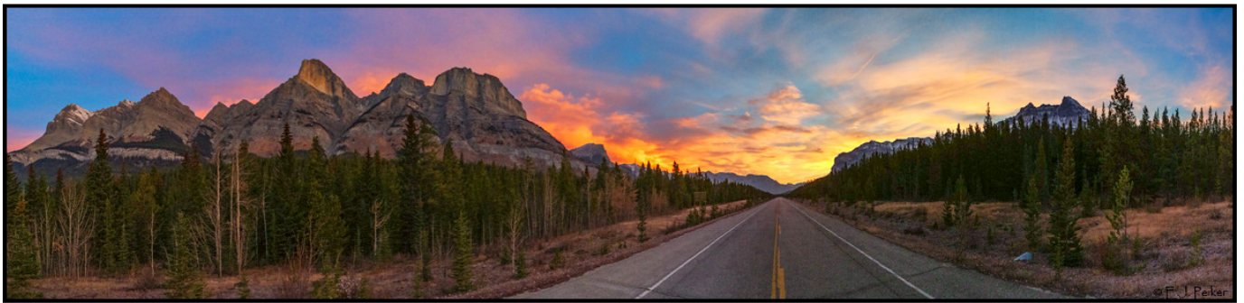
Saskatchewan Junction, Alberta (iPhone 5s)