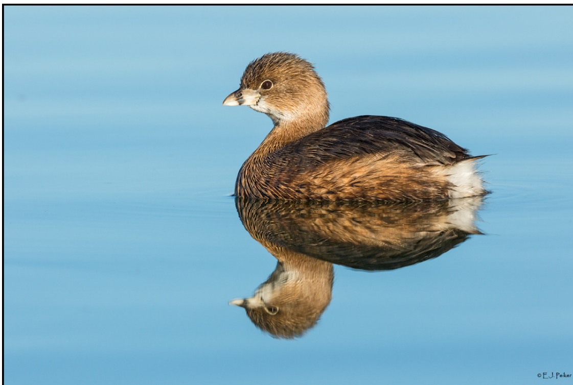
Pied-billed Grebe (EOS 7D Mk II, 500mm)

provides exceptional acquisition speed and tracking of moving subjects. Setting up the autofocus, due to its nearly infinite combinations of settings can be a bit daunting and is probably way over engineered; it leaves no customization stone unturned. For most wildlife action shooters, Canon's Case 1 pre-programmed option is a good starting point for setting up the AF system. I did notice that the camera is extremely sensitive to shutter and mirror induced vibration and the entire camera shakes in your hand when tripping the shutter in a fast continuous shooting mode. Images taken with long lenses on distant subjects in single shot/silent shutter mode, which softens the mirror slap considerably, are significantly sharper than shots taken in normal rapid shutter shooting. When not using the camera at a high frame rate, I would recommend the quiet shutter mode for maximum sharpness. As always, on a small pixel camera, a steady support will give you optimal results. The 7D Mark II is way more sensitive to minor subject or camera vibrations than its full frame big brother, the EOS 1Dx, due to having pixels that are nearly one quarter the physical area of 1Dx pixels. However, with excellent technique, a well supported 7D2 can take incredible photographs.