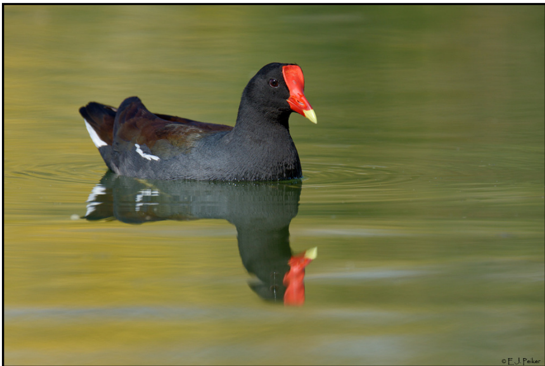
Common Gallinule (D7200, 500mm)

Many were expecting the carbon-fiber build of the D750 with tilting screen. It is disappointing that these were not included. I believe the market for the D7200 would have been significantly larger if these features were included even if it resulted in a camera that was $100 to $200 more expensive. As it stands, the D7200 will primarily appeal to those that need the deeper buffer. In this day and age, all cameras should have a tiltable screen. Lower models of Nikon cameras even have a touch screen. It seems absurd that