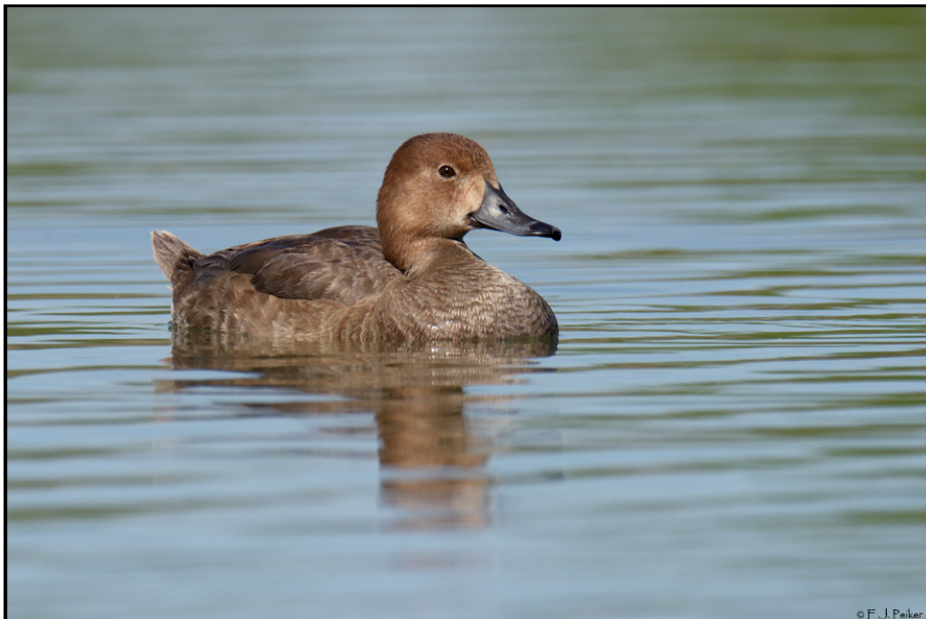
Redhead (D7200, 500mm + 1.4x)