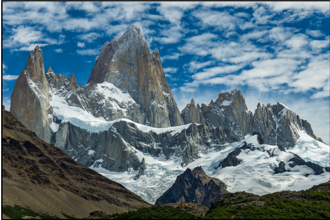
Monte Fitz Roy (a6000, 16-70mm)