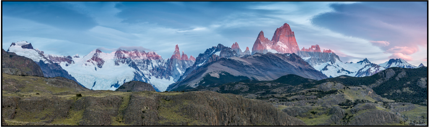
Monte Fitz Roy and Cerro Torre Massif, Argentina