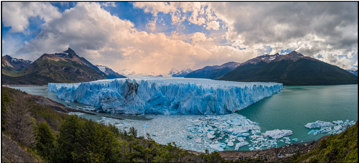
Perito Moreno Glacier (D810, 24-70mm)