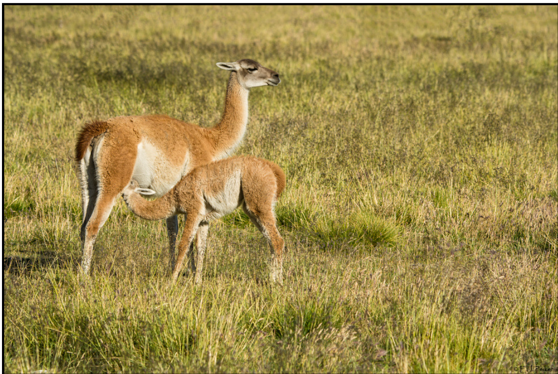
Guanaco Nursing Chulengo (D7100, 80-400mm)

Over the next week we thoroughly explored the park both by vehicle and by foot. Our first morning we got wonderful views and pictures of the Torres with the powerful Cascade Paine in the foreground - by far the best views I had ever seen of these incredible mountains. On our third night we had the most spectacular clouds I have ever seen with a massive standing wave lenticular parked in front of the Cuernos del Paine, another group of mountains within the park (see cover photo of this Newsletter). By midweek, during a rainy morning, we made our way back to Puerto Natales for a refueling and lunch. We discovered a very interesting alternative route to Puerto Natales that is much more scenic than the normal route to the park during the refueling excursion.