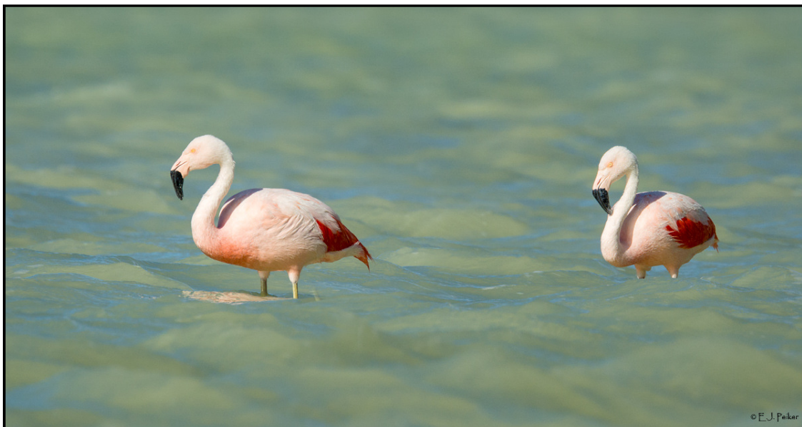
Chilean Flamingos (D7100, 80-400mm)

While in Torres del Paine we photographed every morning and every evening and came away with many great images. We even photographed Chilean Flamingos and a number of other native bird species including Black-necked Swan, Coscoroba Swan, Chiloe Wigeon, Crested Duck, Black-chested Buzzard Eagle, Crested Caracara, and Southern Lapwing.