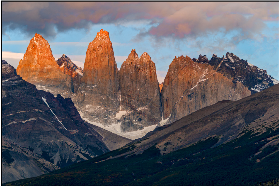
Torres del Paine (D810, 80-400mm)

the Puerto Natales office of our rental car company and were told that they wouldn't do anything about the tire and it was up to us to get it addressed but they did point us towards a tire repair shop. The folks at the tire repair shop were efficient and fast and charged us a mere $3 to fix our leak caused by a small nail. On our way back to Torres del Paine we stopped at a shop at the border crossing and the very nice storekeeper lady informed us that you now have to do all of your Argentina entry paperwork and pay the $160 reciprocity tax online instead of at the border crossing station. She said she would help us get this done but her Internet was not working so I set up my iPhone as a mobile hot-spot, connected her computer to it and we got this done - modern technology is amazing!