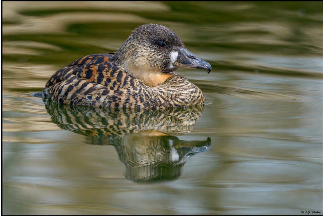
White-backed Duck (D810, 80-400mm)

always, you can visit my Wild Waterfowl of the World page for a complete listing of all species and links to photos of them - http://www.ejphoto.com/wild_waterfowl_species.htm . I have recently updated this to be fully compliant with the latest taxonomic IOC Version 5.1 2015 World Waterfowl List.