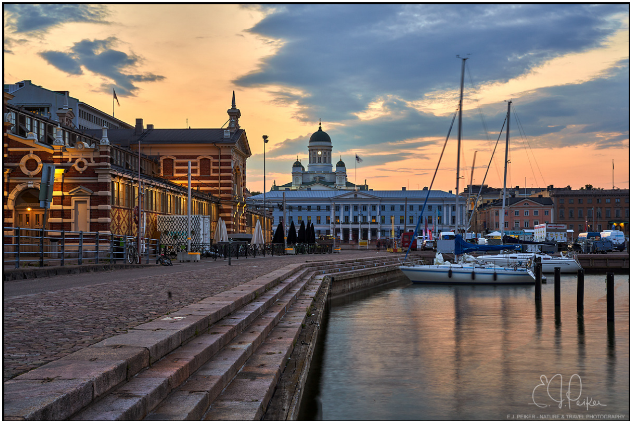
Helsinki, Finland (a7R III, 28-75mm)

In July I made my annual trip to photograph one of the world's great cities. This year's destination was Helsinki, Finland. I had not previously been in Helsinki and chose the location due to its great 19th century architecture and because I had never been to Finland before - one of only two "western" European countries that I hadn't visited. Helsinki is a very vibrant northern city that doesn't really get fully dark this time of year due to its 60 degrees north latitude. While there I averaged 10 miles a day on foot, much of it in late night and very early morning hours to get shots to my liking. I also took a boat tour of the archipelago of islands that are part of the greater Helsinki area. Overall this was a very enjoyable trip and I came away with some nice photos. Photos here: http://www.ejphoto.com/finland_page.htm