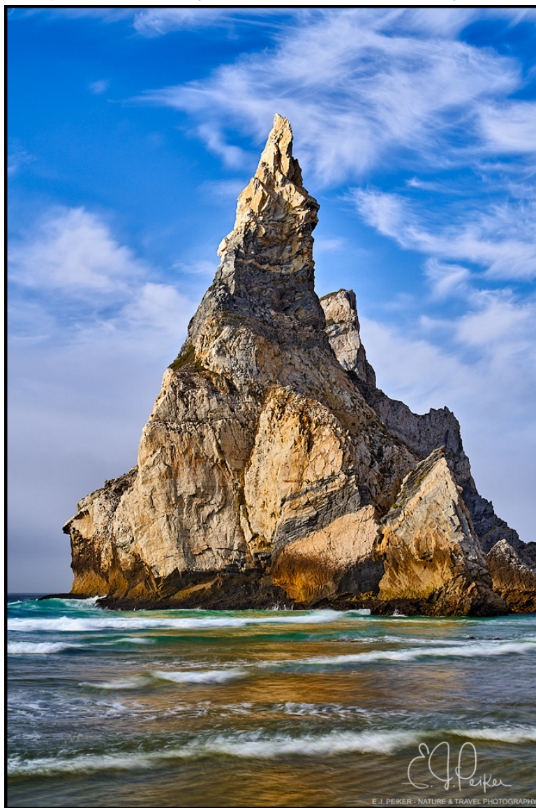
Praia da Ursa, Portugal (a7r III, 24-70mm)

not be surprised to see announcements of all of the Batis and Loxia lenses for Nikon Z and Canon EOS R in the near future as it is a relatively simple redesign to account for the slightly different flange distances once the new mounts have been reverse engineered.