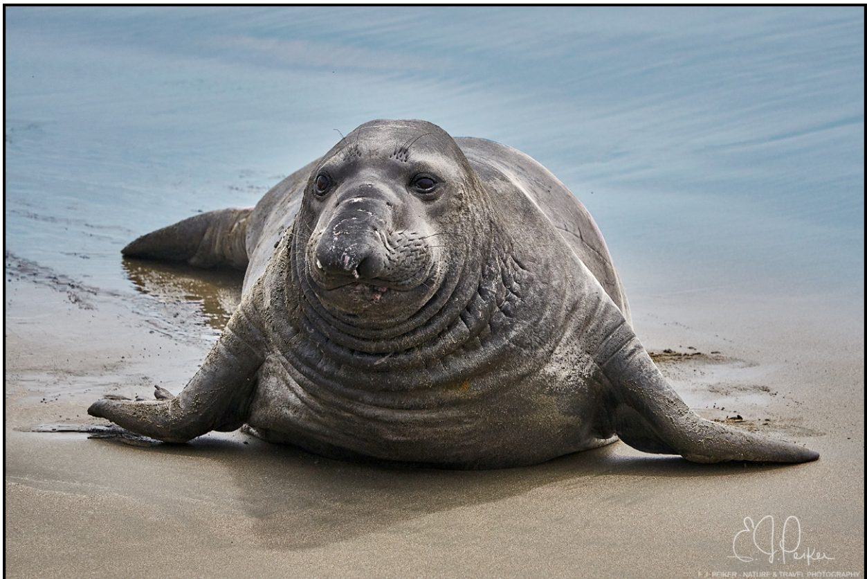
Elephant Seal - San Simeon, California (a7R III, 100-400mm)

Elephant Seals - http://www.ejphoto.com/northern_elephant_seal_page.htm