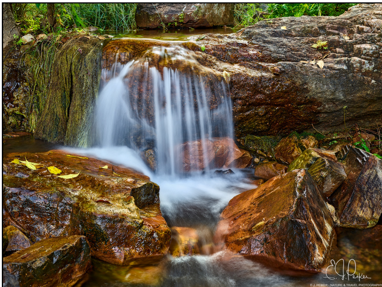
Emma Gorge, Western Australia (P1 XF-IQ3100, 80mm, f/12, 1.6s)

At first glance, the "Story Behind The Photo" picture for this quarter is a smallish, somewhat unremarkable but nice shot of a small waterfall in Western Australia's Kimberley Region take at a beautiful canyon called Emma Gorge. To get the photo, I had to first position myself in the waterfall in the stream standing on a rock with the tripod firmly anchored into the river bed as water flows by. This is one of the reasons why I like a strong tripod with spiked feet; you can firmly plant the tripod in the water and even with water flowing the tripod is rock solid. I then composed the shot and realized there was no good way to avoid a branch from a tree just out of the frame to the left. I took the shot anyway planning to see if I could wade through the river and lift the branch for another shot.