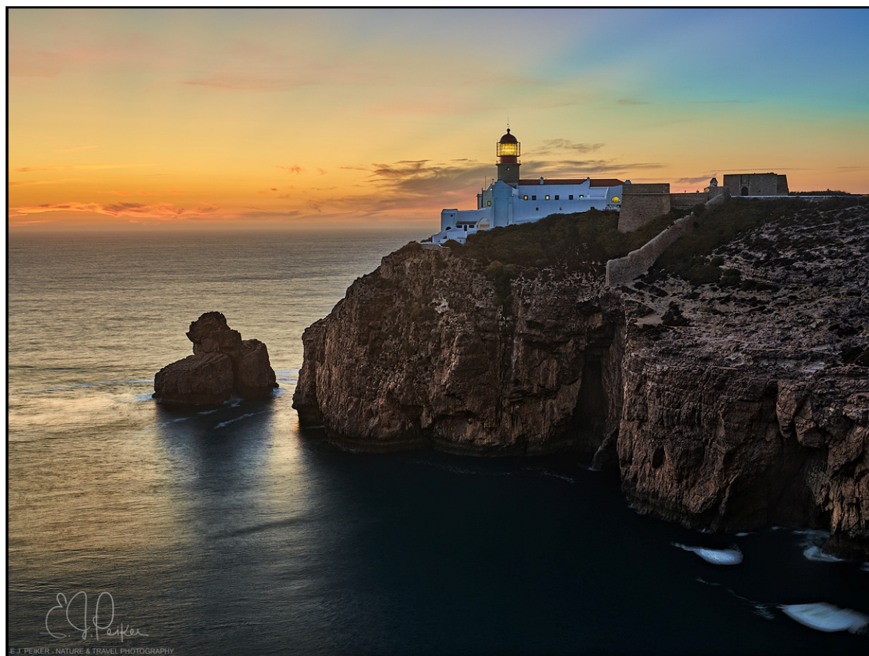
Cabo de Sao Vicente - Portugal (a7R III, 124-70mm)