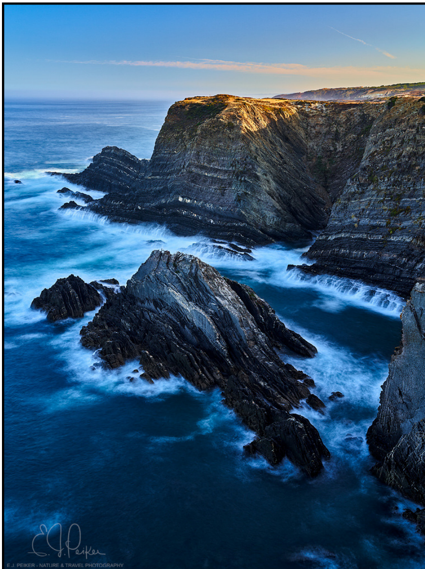
Cabo Sardao, Portugal (a7R III, 24-70mm)

- Megapixel counts will inevitably creep up again even though there is some debate in the industry on this front. An argument can be made that increasing megapixel counts while retaining the APS-C and full frame sensor sizes makes little sense since you are just driving the onset of recording lens diffraction to faster and faster apertures so the 24/45 megapixel level for these two formats is as high as one ever needs to go in a Bayer sensor world. But I predict that due to marketing bigger numbers often driving sales, we will begin to exceed 50 megapixels for full frame sensors and 30 megapixels for APS-C sensors. Without bigger numbers, who is going to replace a nearly perfect D850 body? If one simply scales the newest 44x33mm 100 megapixel medium format sensors available from Sony, the next generation of Sony and Nikon full frame cameras should have 60 megapixels. In the ultra high end market, 100 megapixels for cropped medium format, and 150 megapixels for full frame medium format will become available as early as the end of 2018. The full frame 645 150 megapixel Phase One system and 100 megapixel Fuji GFX have already been announced and I expect Hasselblad to introduce 100megapixel cropped/150 megapixel full frame medium format systems in the near future. These sensors are already in production and in use in aerial surveillance applications.