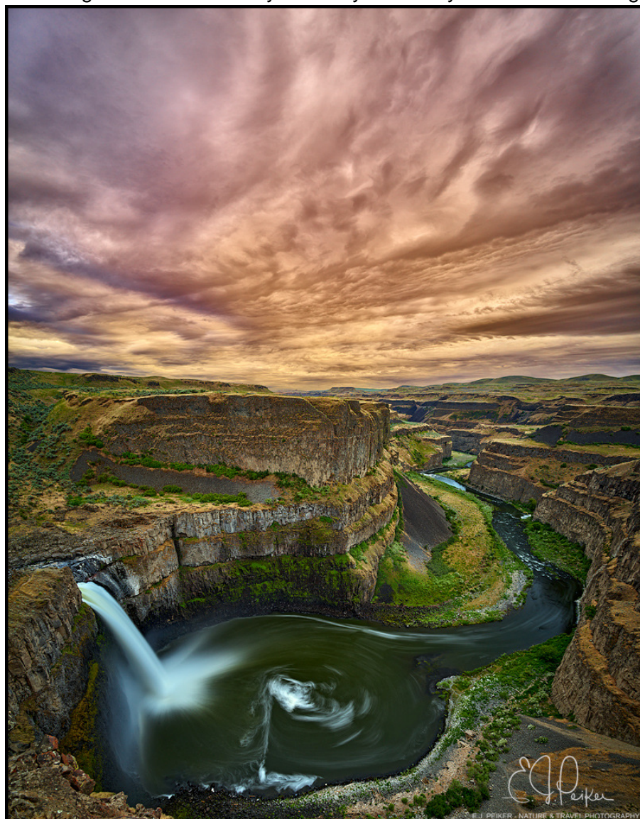
Palouse Falls - Washington (Phase One XF-IQ3100, 28mm)

Over the years, dating all the way back to 2002, most predictions that I have made have come true despite taking some arrows for my predictions, the most notable one being that I predicted EVF's would become a major part of the camera industry and receiving literally dozens of disagreements and even hate mail. These are just my predictions for the coming years. I fully expect most, if not all to come true. The pace of innovation has definitely started to level off in the digital camera industry and development has slowed as well due to much lower sales than there were a decade ago but there are still many innovations that are needed to make the photographic experience better and to fully mature digital camera capabilities.