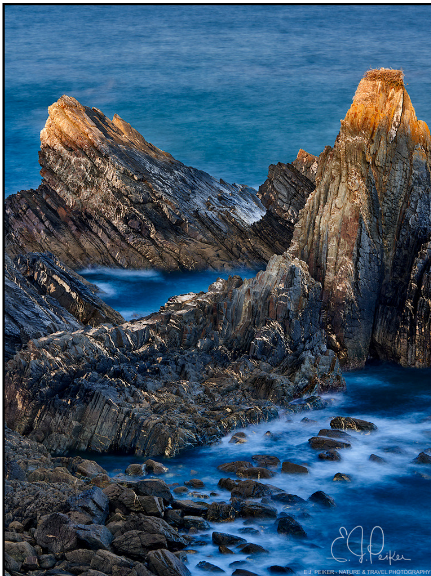
Azenha do Mar, Portugal (a7R III, 100-400mm)

- Vibration shutter mode will find its way into mainstream cameras. Today this is only available in very high end cameras costing tens of thousands of dollars. This is a mode where the camera's motion