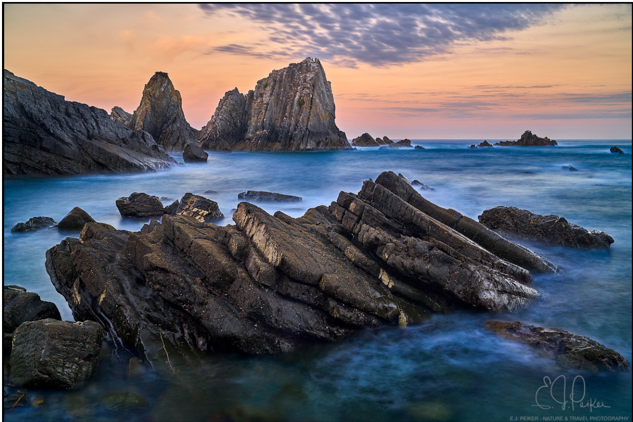
Azenhas do Mar, Portugal (a7R III, 24-70mm)

- Quantitative Computational imaging will begin to play a bigger and bigger role. Want to have good depth of field on your subject but totally blur the background? Computational imaging can make this happen. Want to correct for small aperture diffraction? Computational imaging can do this and automatically correct the RAW file for diffraction based on the aperture the image was taken with.