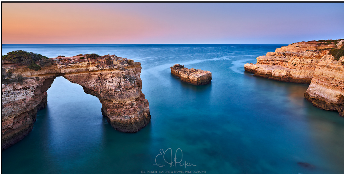
Albandeira, Portugal (a7R III, 16-35mm)