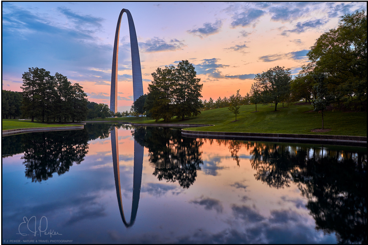
Gateway Arch National Park, Missouri (a7R III, 16-35mm)

I closed out the summer photography season in Portugal. This was the last country in Western Europe that I had not been in. A friend that I met online 17 years ago and have maintained communications with over the years was an immense help in figuring out where to visit and giving me advice from the early planning stages over a year ago through the conclusion of my trip. Intense preparation for this trip was crucial since I was doing it alone, in a country I hadn't been in with a language that I don't know. We even met, finally, and spent an afternoon shooting together and had a nice dinner in the resort town of Cascais. Portugal has an incredible coast with almost endless photographic opportunities of rugged coast line, sea stacks, sea arches, and beautiful beaches. It was an incredible shoot. I worked the southern part of the rugged west coast from north of Cabo Roca, the westernmost point in continental Europe near Lisbon to Ponte de Sao Vicente, the southwestern-most point of Europe. I also worked the southern coast between Lagos and Faro with it's almost infinite number of sea arches and stacks. I also had the opportunity to shoot a couple of the major tourist attractions in Lisbon the morning of my early afternoon flight back to the USA. Portugal is a fantastic photographic destination, one that I very much want to return to. A new section with my Portugal photos will be added by early October: