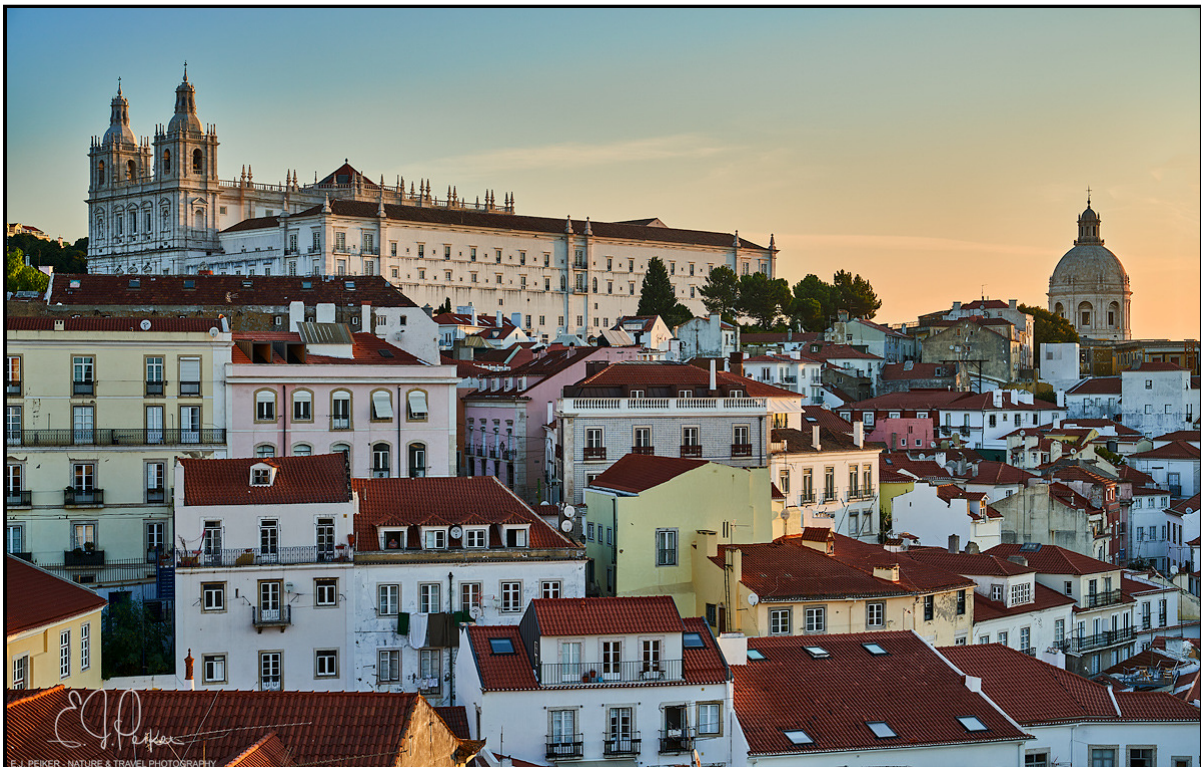
Alfama, Lisbon - Portugal (a7R III, 24-70mm)

- Connectivity will continue to evolve. Today, the digital camera is still nowhere near what it needs to be. Our cell phones run circles around our cameras. The camera manufacturers have, for the time being, tried to link cameras to phones to provide better connectivity but in general, this has been a frustrating experience for users and if somebody wants to post a picture to social media or send one to a friend, they just take it with their cell phone. If cameras became much more connected without having to use the phone as an intermediary, the manufacturers might actually start selling more cameras. Some manufacturer will start to figure this out in the next two years and others will follow.