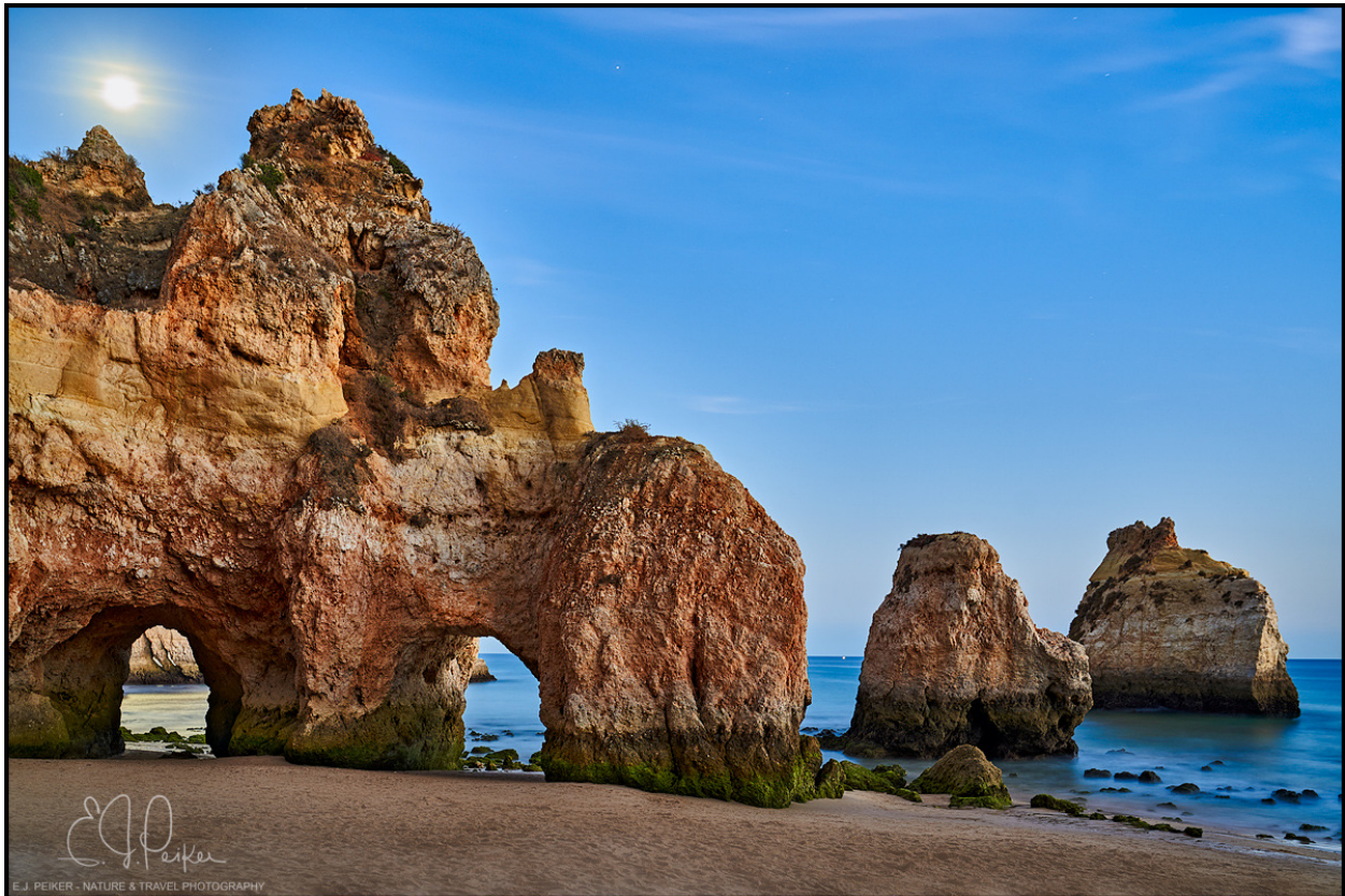
Praia de Marinhas, Portugal (a7R III, 16-35mm)

others in very low light; but real world testing is needed since Canon uses a different AF technology than the others. Canon is the only full frame mirrorless camera manufacturer that does not have sensor based stabilization. The other cameras in this roundup can all stabilize any lens, even old manual focus lenses attached via an adapter, but Canon's camera cannot. Like Nikon, the native mount lens range will be very limited for a few years. It must be noted that Canon is clearly marketing this camera to people already invested in Canon and I can see it, along with an adapter as a credible backup camera to a 5D Mk IV.