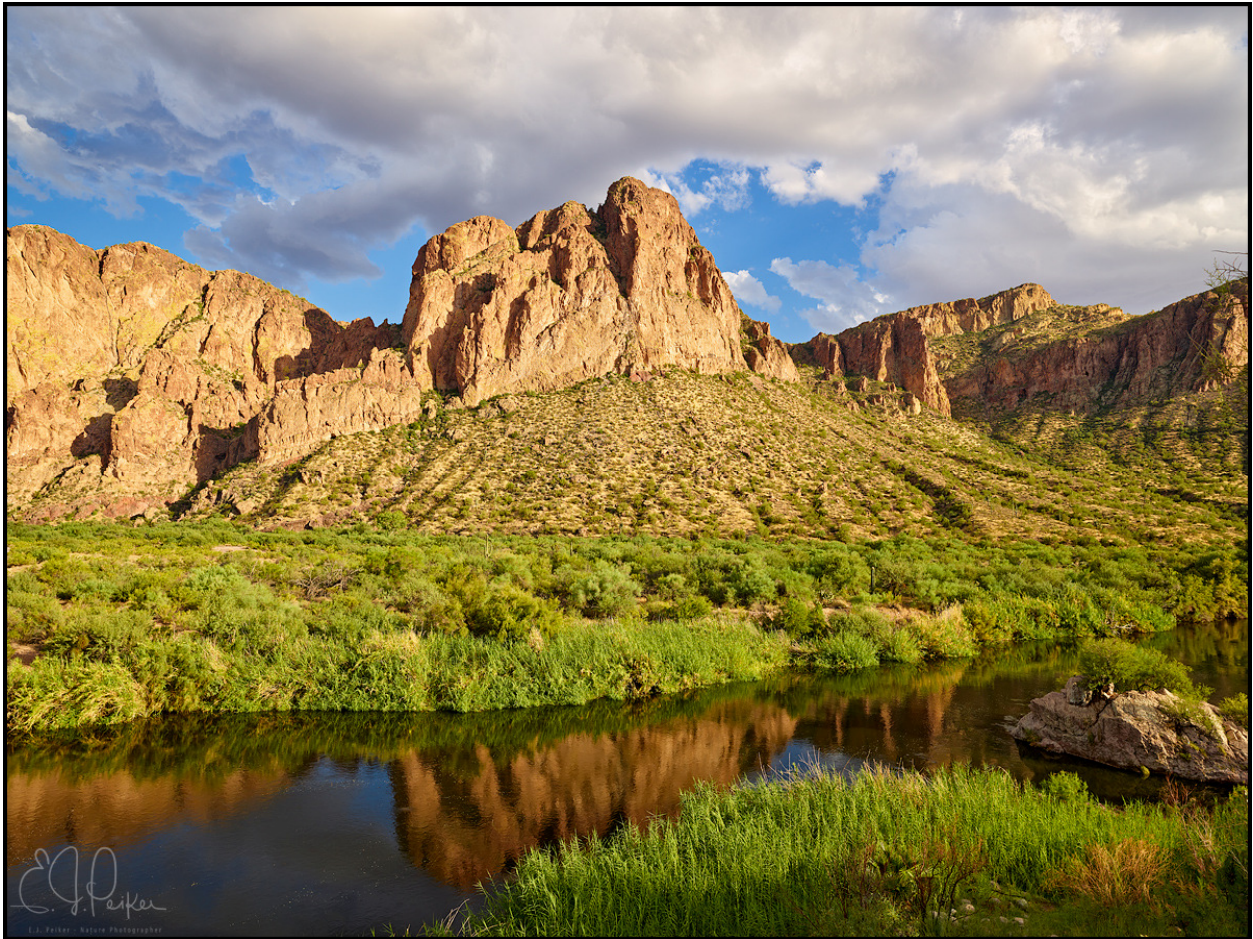
Goldfield Mountains, Arizona (Phase One XF-IQ3100, 35mm)

Even at this small reproduction size there is a rich three dimensionality and the shadowed side of the mountain ridge detail is excellent.